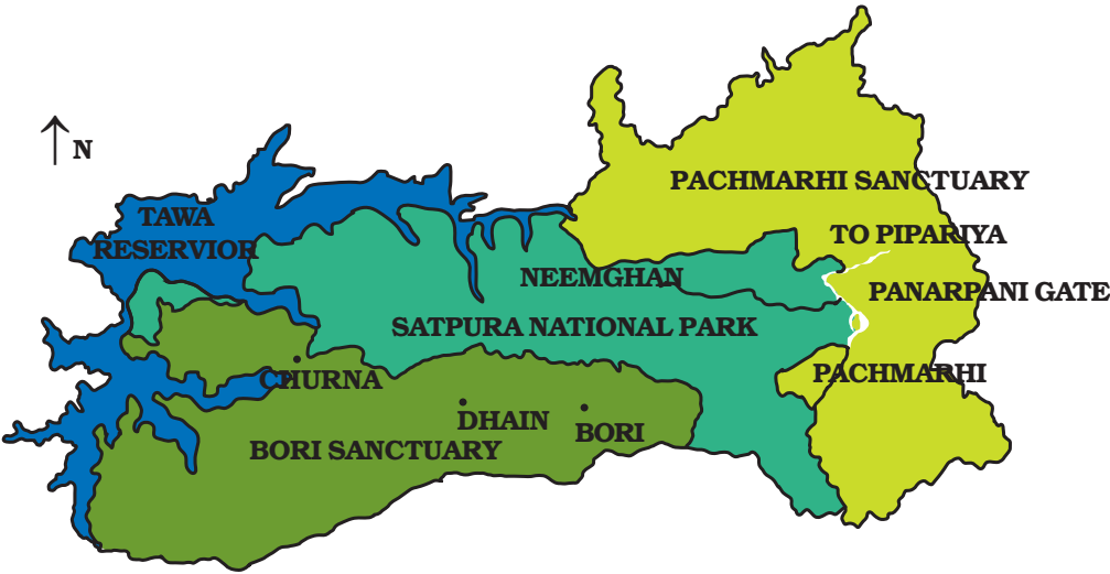
Fig. 6.1 : Pachmarhi Biosphere Reserve