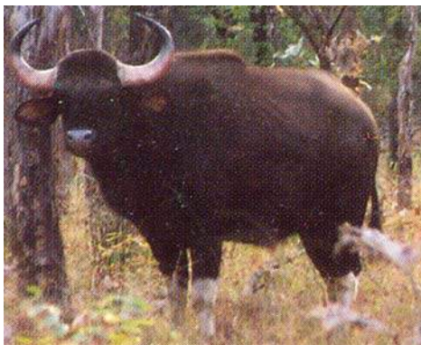
Fig. 6.5 : Wild buffalo

buffaloes (Fig. 6.5) and barasingha (Fig. 6.6) were also found in the Satpura National Park. Animals whose numbers are diminishing to a level that they might face extinction are known as the endangered animals . Boojho is reminded of the dinosaurs which became extinct a long time ago. Survival of some