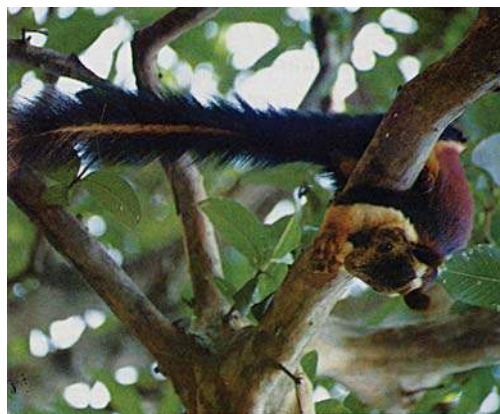
Fig. 6.3 (b) : Giant squirrel

endemic flora of the Pachmarhi Biosphere Reserve. Bison, Indian giant squirrel [Fig. 6.3 (b)] and flying squirrel are endemic fauna of this area. Professor Ahmad explains that the destruction of their habitat, increasing population and introduction of new species may affect the natural habitat of endemic species and endanger their existence.