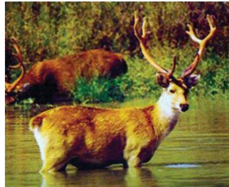
Fig. 6.6 : Barasingha

animals has become difficult because of disturbances in their natural habitat. Professor Ahmad tells them that in order to protect plants and animals strict rules are imposed in all National Parks. Human activities such as grazing, poaching, hunting, capturing of animals or collection of firewood, medicinal plants, etc. are not allowed