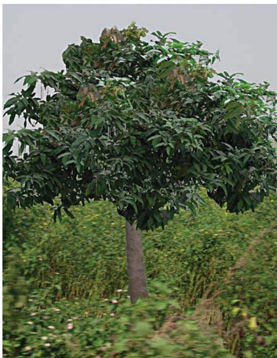
Fig. 6.3 (a) : Wild Mango

Madhavji shows sal and wild mango (Fig. 6.3 (a)) as two examples of the