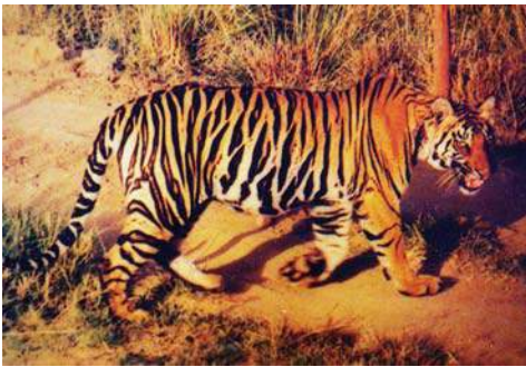
Fig. 6.4 : Tiger

Tiger (Fig. 6.4) is one of the many species which are slowly disappearing from our forests. But, the Satpura Tiger Reserve is unique in the sense that a significant increase in the population of tigers has been seen here. Once upon a time, animals like lions, elephants, wild