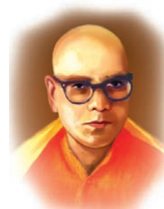
Swami Ramanand Tirtha

Hyderabad Freedom Struggle : Hyderabad was the largest amongst the princely states in India. It comprised Telugu, Kannada and Marathi regional sections. It was ruled by Nizam. He put restrictions on the civil and political rights of his subjects to a great extent. To fight against the suppressive policies of Nizam people of the state established various organisations, namely, ‘Andhra Parishad’ in Telangana, ‘Maharashtra Parishad’ in Marathawada and ‘Karnataka Parishad’ in Karnataka. Swami Ramanand Tirtha led Hyderabad freedom struggle skillfully with the help of loyal workers of these three organisations. He founded the ‘Hyderabad State Congress’ and gave a momentum to the struggle for Hyderabad’s accession.