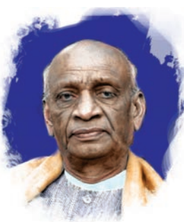
Sardar Vallabhbhai Patel

When India gained independence, there were more than 600 princely states of various size. Their political integration was the biggest challenge faced by the leaders of independent India. There