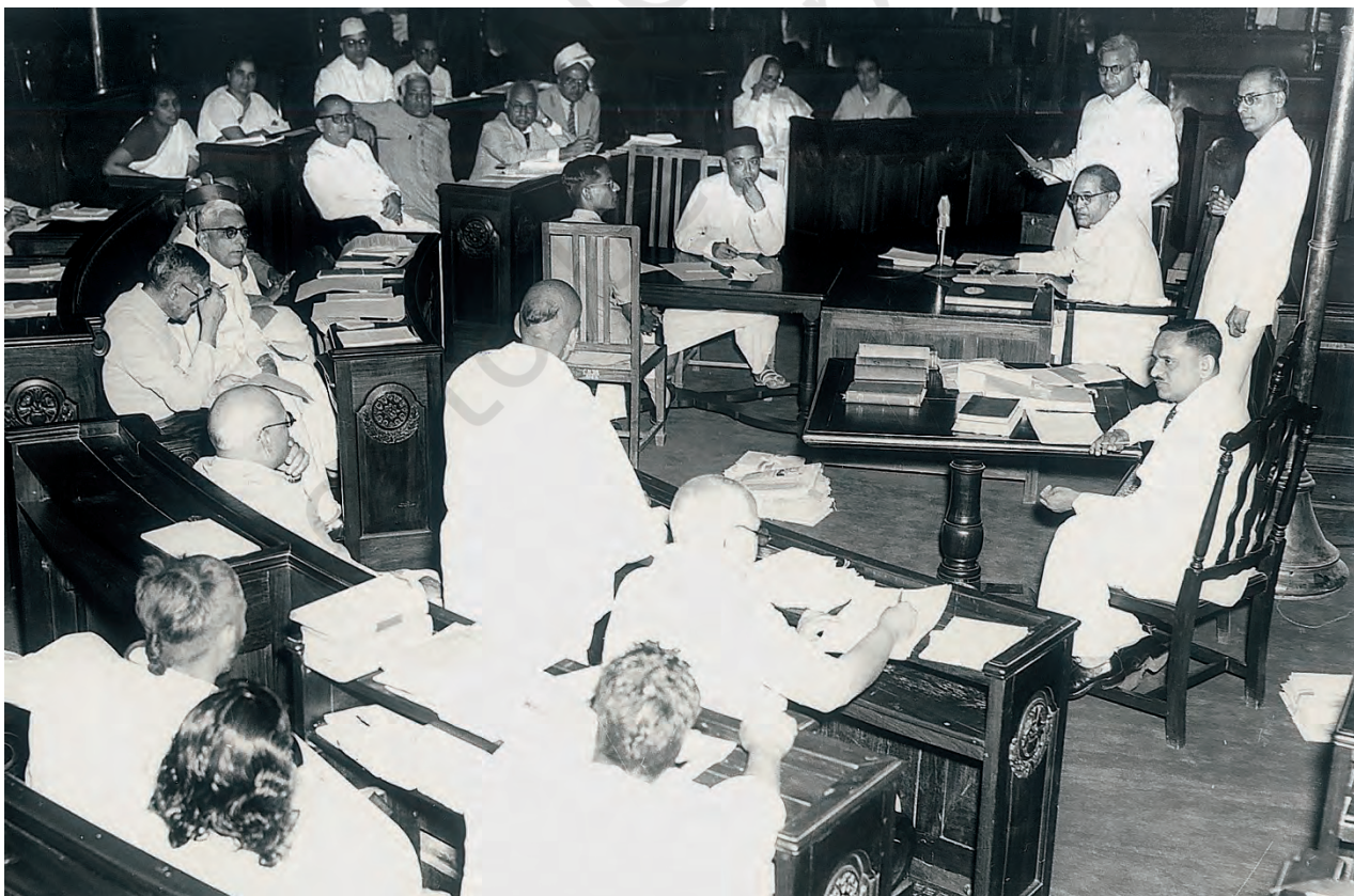
Fig. 15.5 B. R. Ambedkar presiding over a discussion of the Hindu Code Bill

Look again at Chapters 13 and 14. Discuss how the political situation of the time may have shaped the nature of the debates within the Constituent Assembly.