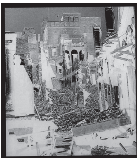
Fig. 15.2 Images of desolation and destruction continued to haunt members of the Constituent Assembly.

From your political science textbooks you know what the Constitution of India is, and you have seen how it has worked over the decades since Independence. This chapter will introduce you to the history that lies behind the Constitution, and the intense debates that were part of its making. If we try and hear the voices within the Constituent Assembly, we get an idea of the process through which the Constitution was framed and the vision of the new nation formulated.