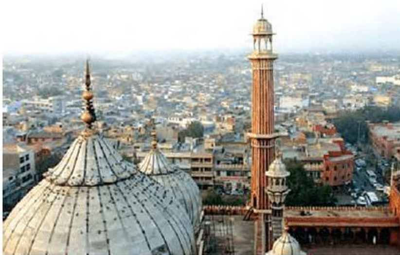
Delhi, the Political capital of India

are the main languages spoken in Delhi. Almost all the religions of the world are represented here.