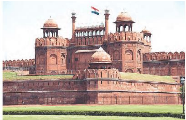
Lal Quila (Red Fort)

Delhi is a very old city. The present site and nearby area had been made capital by various kings many times. Yudhistir, the eldest of Pandava brothers from the Mahabharata was the first to settle down here. Then its name was Indraprastha.