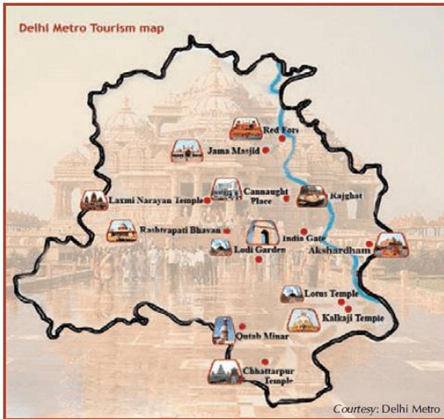
Map of Delhi

It is a big manufacturing and business centre. Delhi is densely populated and almost every place is over crowded. Result is that it is a highly polluted city. Climate of Delhi is hot in summer and cold in winter. It gets about 650 mm of rains during rainy season.