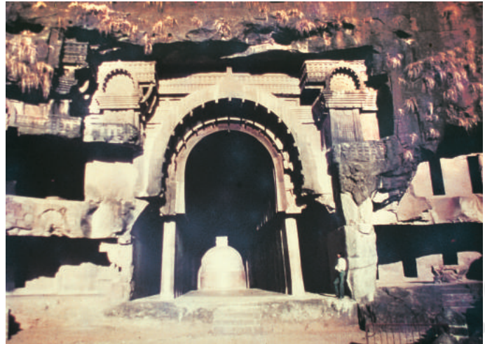
A cave at Karle, Maharashtra

Read page 100 once more. Can you think of how Buddhism spread to these lands?