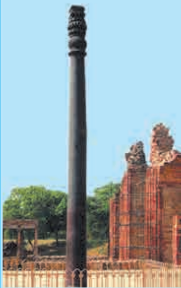
Iron Pillar : Mehrauli

You would like to know : In the Gupta period, there was remarkable progress in making alloys and casting of metals. The