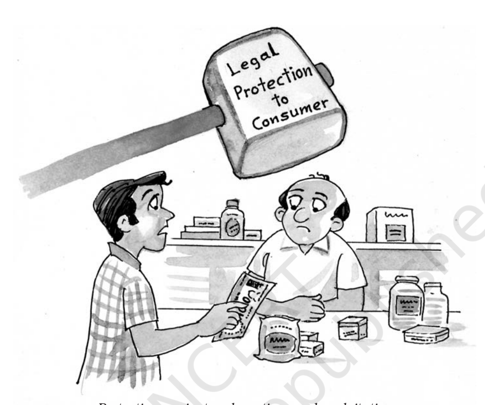
Protection against malpractices and exploitation

teleshopping or direct selling or multilevel marketing. However, any person who obtains goods or avails