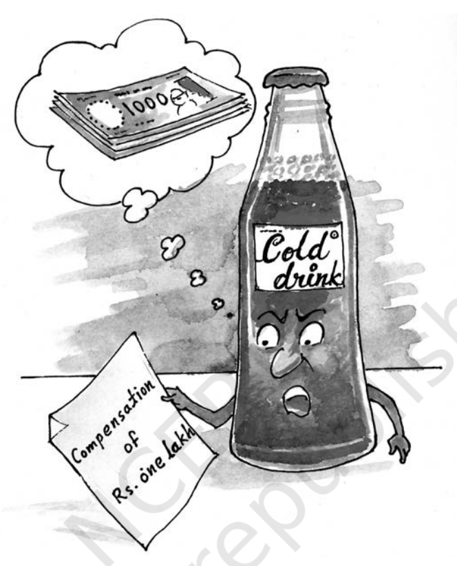
Compensation for impurities in cold drinks

(iii) Widespread Exploitation of Consumers: Consumers might be exploited by unscrupulous, exploitative and unfair trade practices like defective and unsafe products, adulteration, false and misleading advertising, hoarding, black- marketing, etc. Consumers need protection against such malpractices of the sellers.