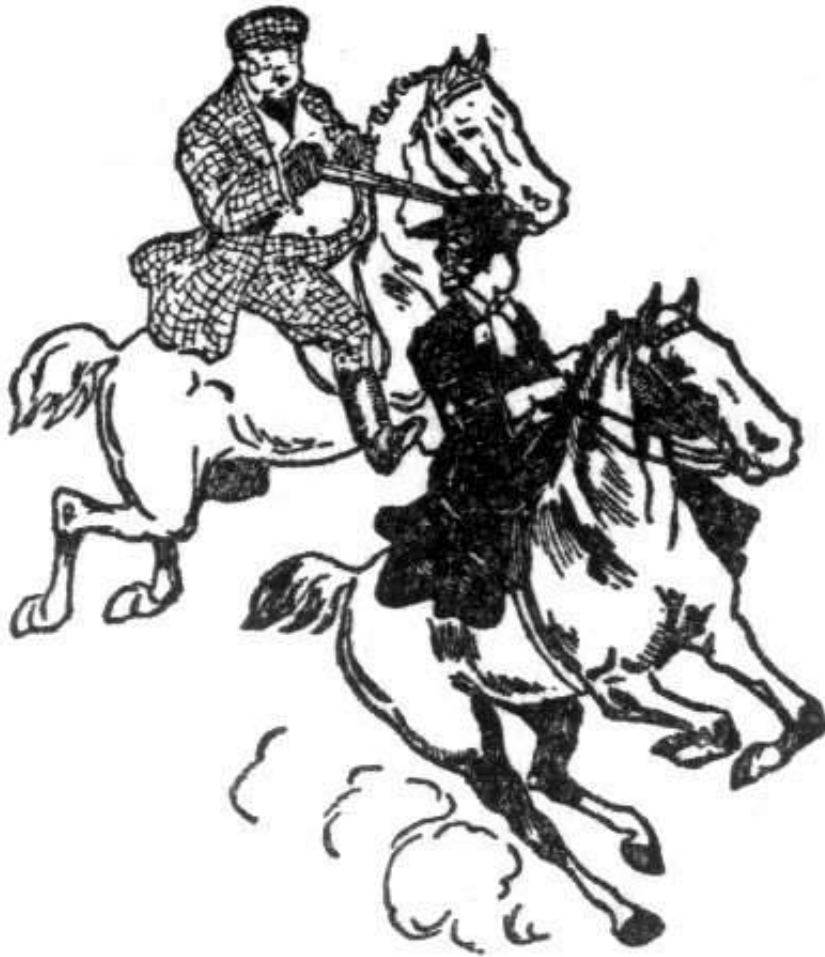
"HAD ONCE RACED OLD LORD BILTON ON HER PONY"

had telegraphed for a waggonette to meet them, and they started on their drive in high spirits. It was a lovely July evening, and the air was delicate with the scent of the pinewoods. Now and then they heard a wood-pigeon brooding over its own sweet voice, or saw, deep in the rustling fern, the burnished breast of the pheasant. Little squirrels peered at them from the beech-trees as they went by, and the rabbits scudded away through the brushwood and over the mossy