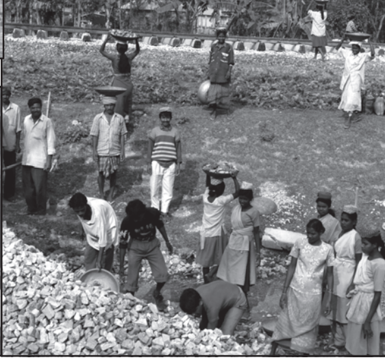
Discuss the visuals What kind of pluralities and inequalities do they show?