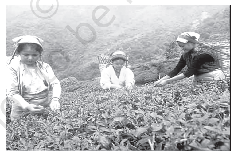
Tea pickers in Assam

Other changes have also redefined the nature of sociology and social anthropology. Modernity as we saw led to a process whereby the smallest village was impacted by global processes. The most obvious example is colonialism. The most remote village of India under British colonialism saw its land laws and administration change, its revenue extraction alter, its manufacturing industries collapse.