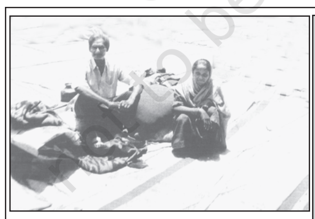
A homeless couple

The facts of contemporary history are also facts about the success and the failure of individual men and women. When a society is industrialised, a peasant becomes a worker; a feudal lord is liquidated or becomes a businessman. When classes rise or fall, a man is employed or unemployed; when the rate of investment goes up or down, a man takes new heart or goes broke. When wars happen, an insurance salesman becomes a rocket launcher; a store clerk, a radar man; a wife lives alone; a child grows up without a father. Neither the life of an individual nor the history of a society can be understood without understanding both... (Mills 1959).