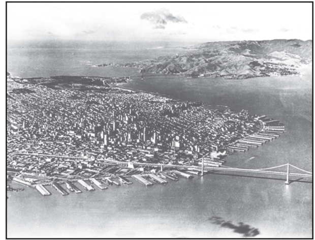
Fig. 9.5: San Francisco, the largest land-locked harbour in the world

The ports provide facilities of docking, loading, unloading and the storage facilities for cargo. In order to provide these facilities, the port authorities make arrangements for maintaining navigable channels, arranging tugs and barges, and providing labour and managerial services. The importance of a port is judged by the size of cargo and the number of ships handled. The quantity of cargo handled by a port is an indicator of the level of development of its hinterland.