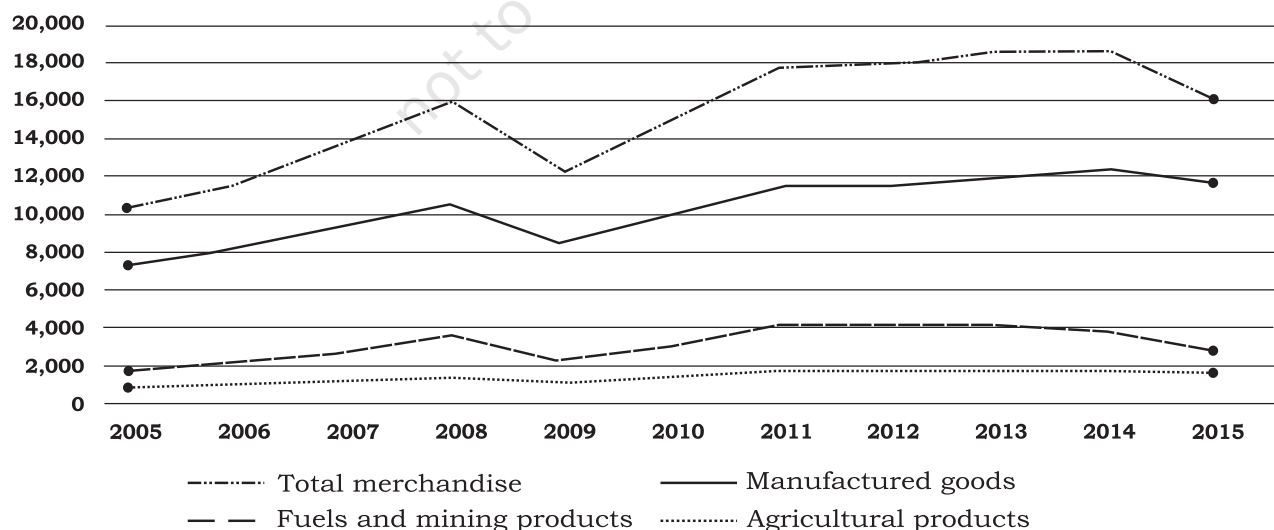
Fig. 9.1 World merchandise exports, 2005-2015

Source: wits.worldbank.org as on 21.07.17