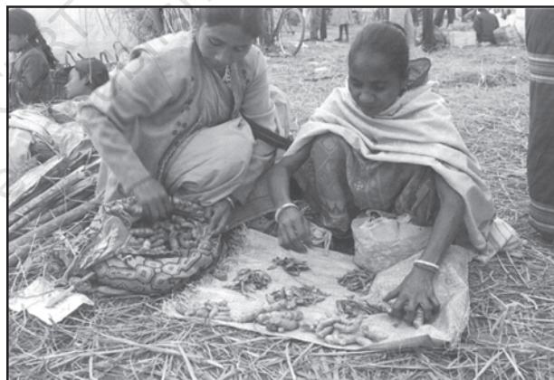
Fig. 9.1: Two women practising barter system in Jon Beel Mela

The initial form of trade in primitive societies was the barter system , where direct exchange of goods took place. In this system if you were a potter and were in need of a plumber, you would have to look for a plumber who would be in need of pots and you could exchange your pots for his plumbing service.