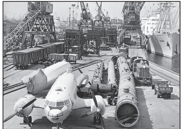
Fig. 9.6: Leningrad Commercial Port