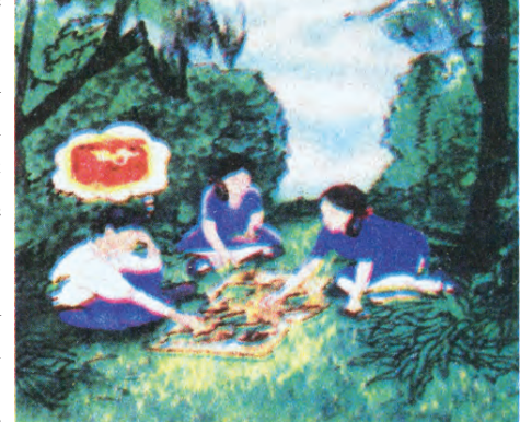
Figure 7.1 Imagine you and your friends have found pieces of an old map to reach a treasure. Would

For example, take the triad consisting of lithium (Li), sodium (Na) and potassium (K) masses of Li