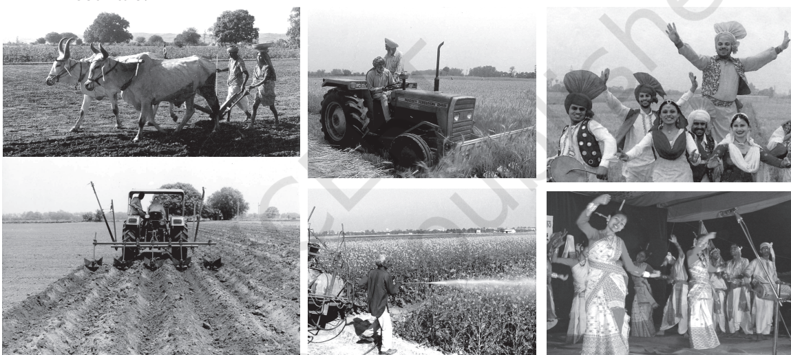
Different means of agriculture and related festivals.

Indian society is primarily a rural society though urbanisation is growing. The majority of India's people live in rural areas (69 per cent, according to the 2011 Census). They make their living from agriculture or related occupations. This means that agricultural land is the most important productive resource for a great many Indians. Land is also the most important form of property. But land is not just a 'means of production' nor just a 'form of property'. Nor is agriculture just a form of livelihood. It is also a way of life. Many of our cultural practices and patterns can be traced to our agrarian backgrounds. You will recall from the earlier chapters how closely interrelated structural and cultural changes are. For example, most of the New Year festivals in different regions of India – such as Pongal in Tamil Nadu, Bihu in Assam, Baisakhi in Punjab and Ugadi in Karnataka to name just a few – actually celebrate the main harvest season and herald the beginning of a new agricultural season. Find out about other harvest festivals.