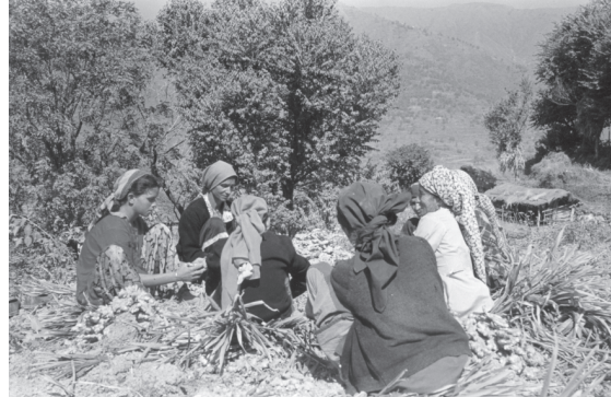
Cultivation in different parts of the country