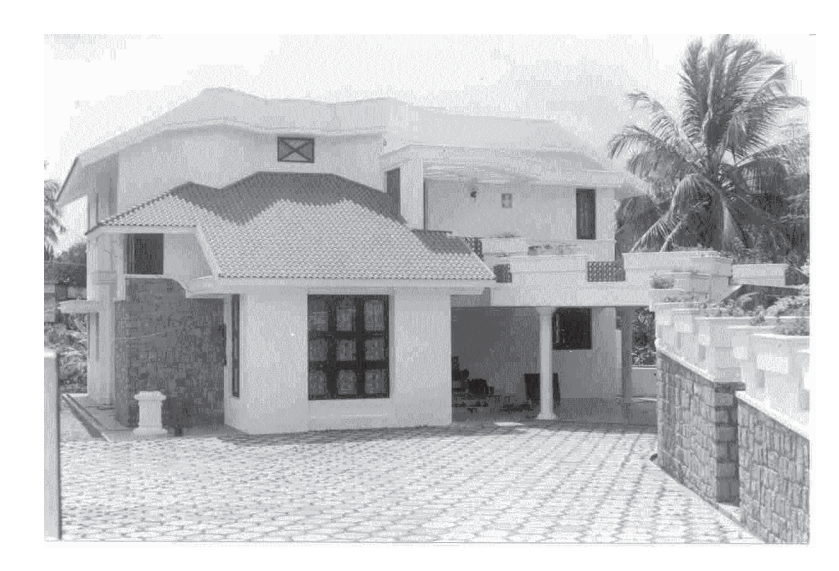
Look at this house 'Sukrutham' in a village in Kerala. It is located in Yakkar Village, 3 kilometres from Palakkad district town