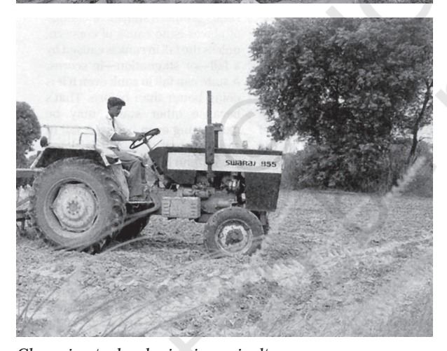
Changing technologies in agriculture