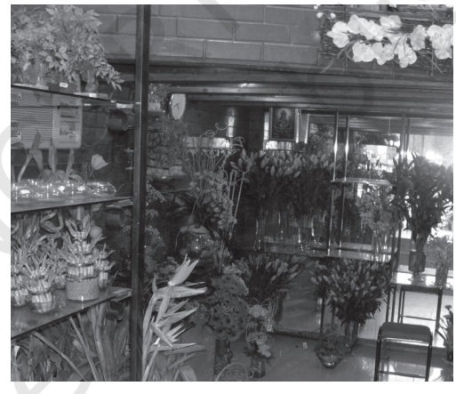
Farming of Flowers

Another, and more widespread aspect of the globalisation of agriculture is the entry of multinationals into this sector as sellers of agricultural inputs such as seeds, pesticides, and fertilisers. Over the last decade or so, the government has scaled down its agricultural development programmes, and 'agricultural extension' agents have been replaced in the villages by agents of seed, fertiliser, and pesticide companies. These agents are often the sole source of information for farmers about new seeds or cultivation practices, and of course they have an interest in selling their products. This has led to the increased dependence of farmers on expensive fertilisers and pesticides, which has reduced their profits, put many farmers into debt, and also created an ecological crisis in rural areas.