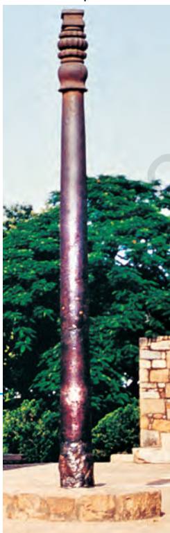
The iron pillar

on the pillar mentioning a ruler named Chandra, who probably belonged to the Gupta dynasty (Chapter 11). What is amazing is the fact that the pillar has not rusted in all these years.