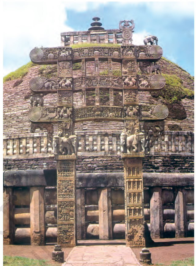
Top : The Great Stupa at Sanchi, Madhya Pradesh. Stupas like this one were built over several centuries. While the brick mound probably dates to the time of Ashoka (Chapter 8), the railings and gateways were added during the time of later rulers.