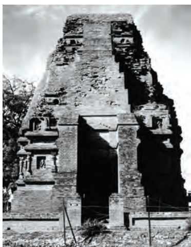
Top : An early temple at Bhitargaon, Uttar Pradesh.

This was built about 1500 years ago, and was made of baked brick and stone.