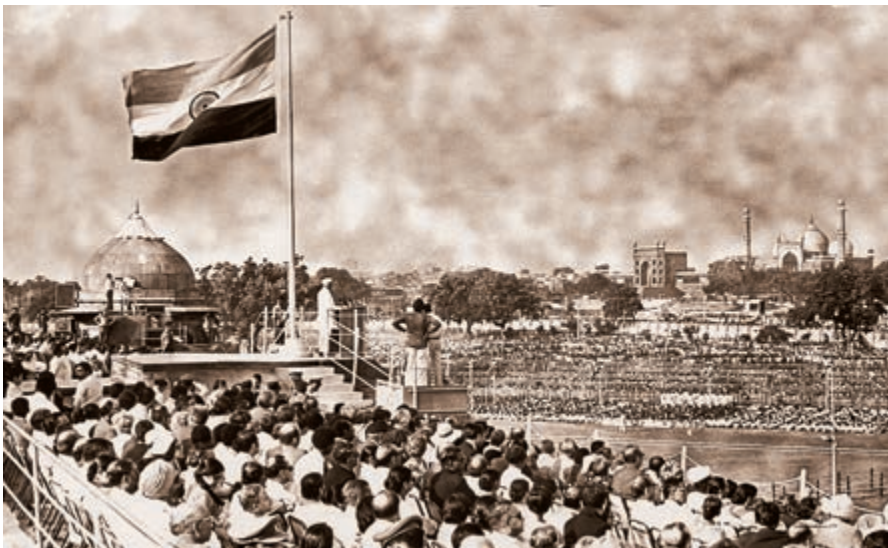
Pt. Nehru delivering an Independence Day speech

Songs and symbols that emerged during the freedom struggle serve as a constant reminder of our country's rich tradition of respect for diversity. Do you know the story of the Indian flag? It was used as a symbol of protest against the British by people everywhere.