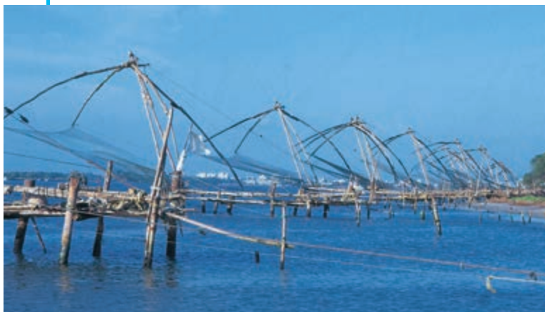
Chinese Fishing Nets

Even the utensil used for frying is called the cheenachatti , and it is believed that the word cheen could have come from China. The fertile land and climate are suited to growing rice and a majority of people here eat rice, fish and vegetables.