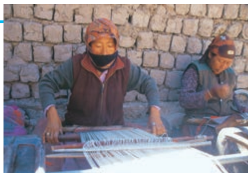
Woman weaving a pashmina shawl

Buddhism reached Tibet via Ladakh. Ladakh is also called Little Tibet. Islam was introduced in this region more than four hundred years ago and there is a significant Muslim population here. Ladakh has a very rich oral tradition of songs and poems. Local versions of the Tibetan national epic the Kesar Saga are performed and sung by both Muslims and Buddhists.