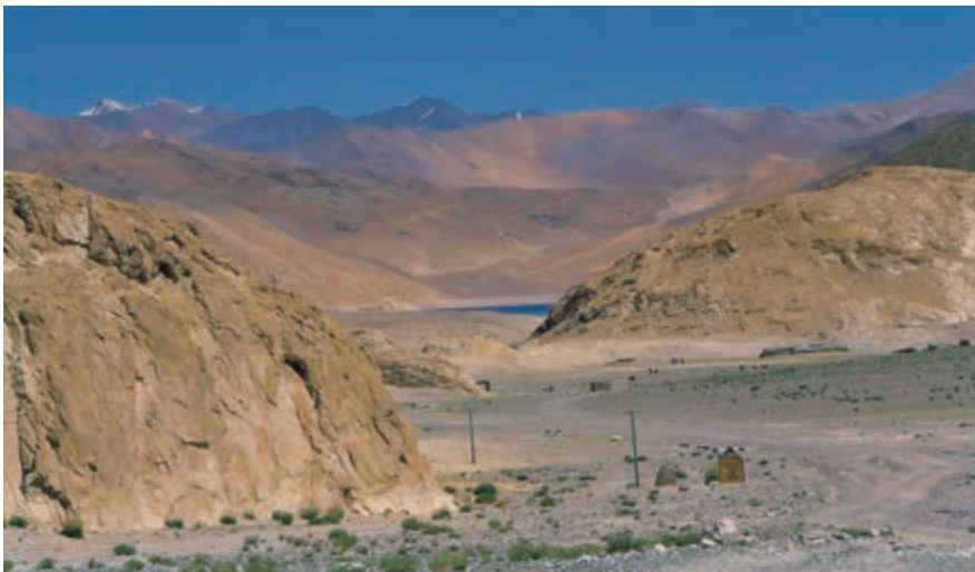
The dry barren landscape of the mountainous desert of Ladakh.

Union Territory of Ladakh is a desert in the mountains in the northern part of