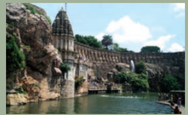
Fig. 4b. Chittorgarh Fort, Rajasthan

Many Rajput chieftains built a number of forts on hill tops which became centres of power. With extensive fortifications, these majestic structures housed urban centres, palaces, temples, trading centres, water harvesting structures and other buildings. The Chittorgarh fort contained many water bodies varying from talabs (ponds) to kundis (wells), baolis (stepwells), etc.