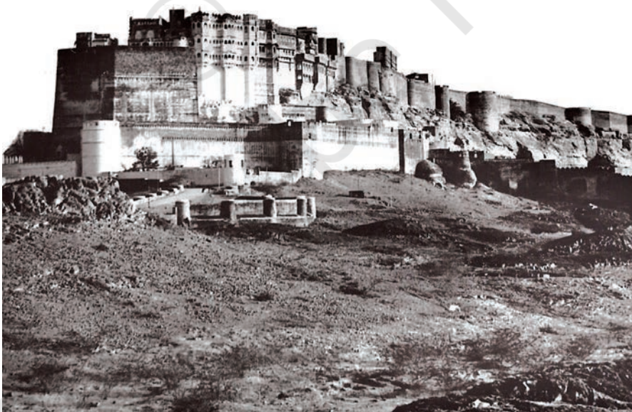
Fig. 5 Mehrangarh Fort, Jodhpur

Raja Jai Singh was at the height of his power. He was the governor of Agra for 12 years and of Malwa for 5 or 6 years. He possessed a large army, artillery and great wealth. His sway extended from Delhi to the banks of the Narmada.