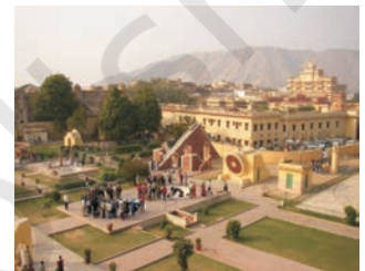
Fig. 4c Jantar Mantar in Jaipur

Sawai Jai Singh, the ruler of Amber constructed five astronomical observatories, one each in Delhi, Jaipur, Ujjain, Mathura and Varanasi. Commonly known as Jantar Mantar, these observatories had various instruments to study heavenly bodies.