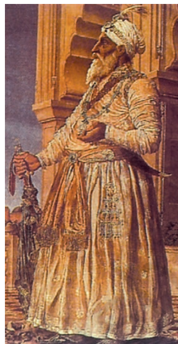
Fig. 3 Burhan-ul-Mulk Sa'adat Khan.

The state depended on local bankers and mahajans for loans. It sold the right to collect tax to the highest bidders. These "revenue farmers" ( ijaradars ) agreed to pay the state a fixed sum of money. Local bankers guaranteed the payment of this contracted amount to the state. In turn, the revenue-farmers were given considerable freedom in the assessment and collection of taxes. These developments allowed new social groups, like moneylenders and bankers, to influence