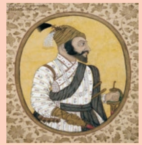
Fig. 7a Portrait of Shivaji

The Maratha kingdom was another powerful regional kingdom to arise out of a sustained opposition to Mughal rule. Shivaji (1627-1680) carved out a stable kingdom with the support of powerful warrior families ( deshmukhs ). Groups of highly mobile, peasant-pastoralists ( kunbis ) provided the backbone of the Maratha army. Shivaji used these forces to challenge the Mughals in the peninsula. After Shivaji's death, effective power in the Maratha state was wielded by a family of Chitpavan Brahmanas who served Shivaji's successors as Peshwa (or principal minister). Poona became the capital of the Maratha kingdom.