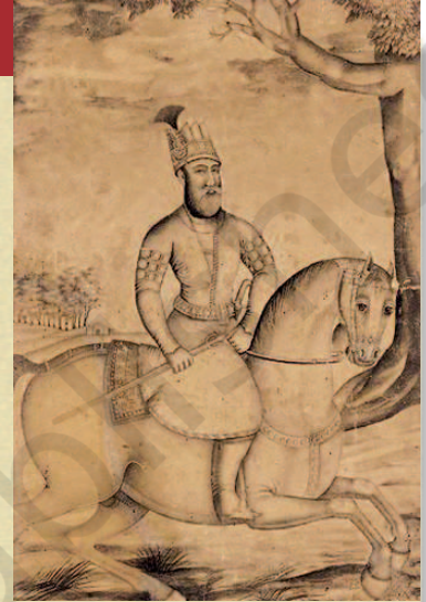
Fig. 1 A 1779 portrait of Nadir Shah.