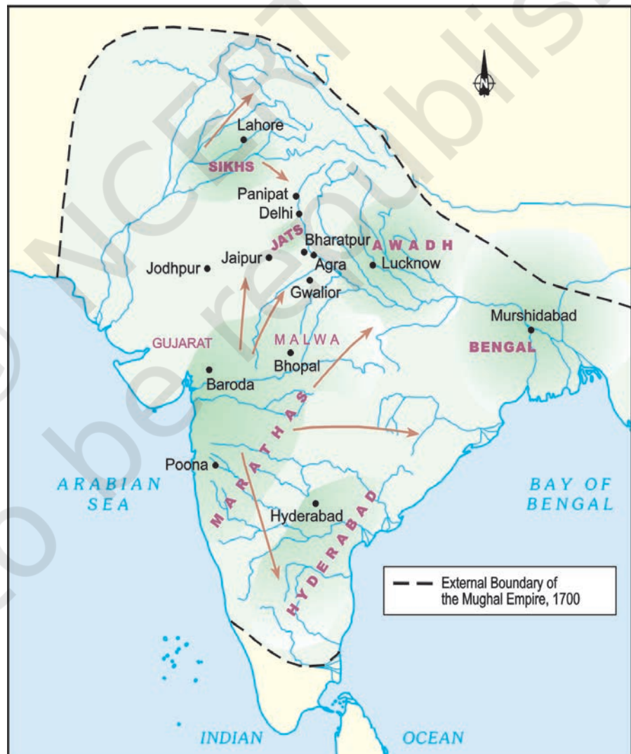
Map 1 State formations in the eighteenth century.

If you look at Maps 1 and 2 closely, you will see something significant happening in the subcontinent during the first half of the eighteenth century. Notice how the boundaries of the Mughal Empire were reshaped by the emergence of a number of independent