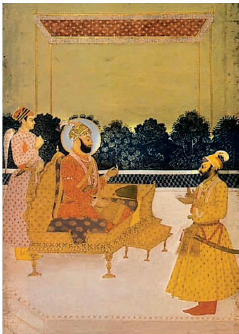
Fig. 2 Farrukh Siyar receiving a noble in court.

possible humiliation came when two Mughal emperors, Farrukh Siyar (1713-1719) and Alamgir II (1754-1759) were assassinated, and two others Ahmad Shah (1748-1754) and Shah Alam II (1759-1816) were blinded by their nobles.