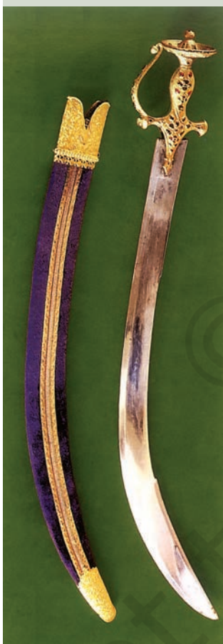
Fig. 7 Sword of Maharaja Ranjit Singh.

What is the Khalsa ? Do you recall reading about it in Chapter 8?