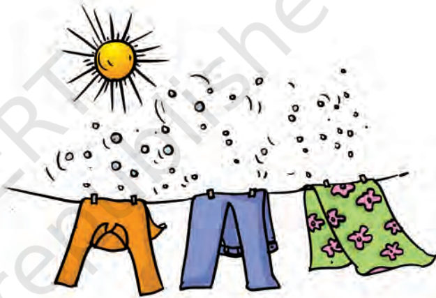
Fig. 14.4 Clothes drying on a clothes-line

How many times have you noticed that water spilled on a floor dries up after some time? The water seems to disappear. Similarly, water disappears from wet clothes as they dry up (Fig. 14.4). Water from wet roads, rooftops and a few other places also disappears after the rains. Where does this water go?