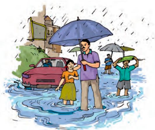
Fig. 14.10 A scene after heavy rains

The time, duration and the amount of rainfall varies from place to place. In some parts of the world it rains throughout the year while there are places where it rains only for a few days.