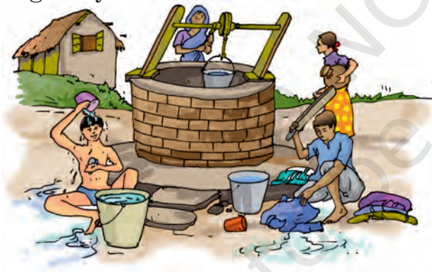
Fig. 14.1 Uses of water

Apart from drinking, there are so many activities for which we use water (Fig. 14.1). Do you have an idea about the quantity of water we use in a single day?