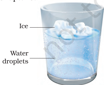
Fig. 14.6 Drops of water appear on outer surface of the glass containing water with ice

From where do water drops appear on the outer side of the glass? The cold surface of the glass containing iced water, cools the air around it, and the water vapour of the air condenses on the surface of the glass. We noticed this process of condensation in Activity 7 in Chapter 5.