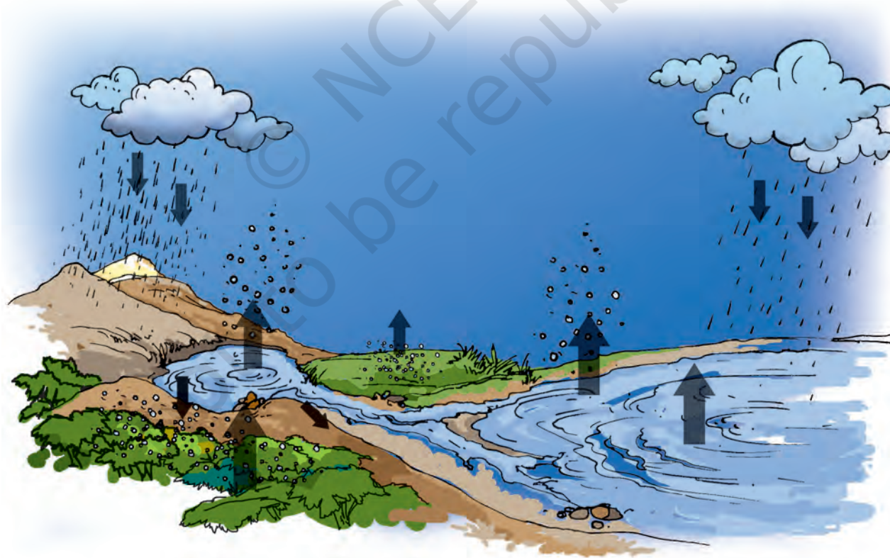
Fig. 14.9 Water cycle

However, excess of rainfall may lead to many problems (Fig. 14.10). Heavy