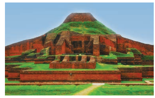
Somapura Mahavihara (Bangladesh)

Two artists of this period were Dhiman and his son Vitapala. They were great painters, sculptors and bronze statue makers. The Pala school of sculptural art was influenced by the Gupta art. Mahipala I constructed and repaired several sacred structures at Saranath, Nalanda and Bodh Gaya. Gopala founded the famous monastery at Odantapura (Bihar). Dharmapala established the Vikramashila and the Somapura Mahaviharas (Bangladesh).