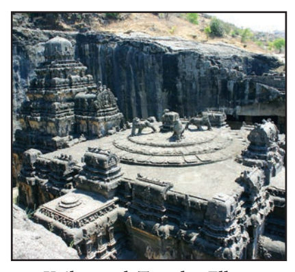
Kailasanath Temple - Ellora

The Rashtrakuta rulers were great patrons of learning. Kannada and Sanskrit literature made great progress during their reign. Amoghavarsha I was the author of Prasnottaramalika , a Sanskrit