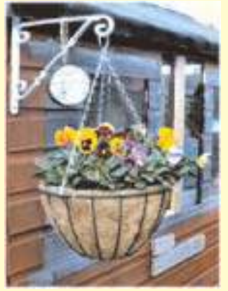
Annuals in hanging basket

Hanging baskets with training of cascading plants are suited for indoors as well as outdoors. Such baskets can be hanged at the entrance of the house or can be kept in the lawn or in a hall or can be suspended from trees, electric poles or fences. Plants like petunias, salvia, pansies and geranium are suitable for hanging baskets.