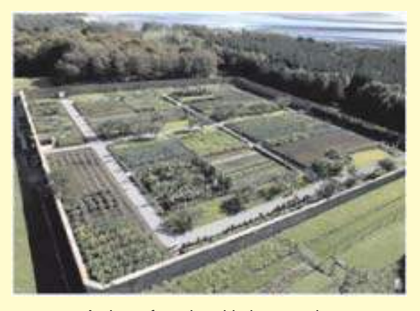
A view of modern kitchen garden

A well maintained kitchen garden can provide fruits, vegetables and cut flowers throughout the year. In kitchen garden, intensive system of planting is followed. On bunds, vegetables like carrot, radish, and in the fields cabbage, cauliflower, and dhania can be easily grown. Near the wall of house, some trailing type bean should be grown. Among fruits, choice is limited but strawberry, Amrapali mango, Kagzi