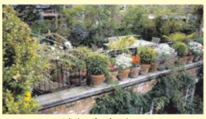
A view of roof garden

In big towns and cities, availability of cultivable land is a big problem. In spite of this, horticulture can be taken as one of the enterprises in such areas as well by growing horticultural plants on the roof of house or balcony. Roof garden is one of popular alternatives in urban areas, because of the limited available space in the grounds of a house. However, care should be exercised to confirm that the roof of the house is strong enough to bear the heavy load of soil and potted plants. In roof garden, potted plants like cacti and succulents, chrysanthemums, dahlias, orchids, bougainvillea, roses, seasonal flowers and several kinds of shrubs and herbs can be