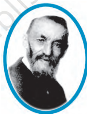
G. Peano (1858-1932)

In contrast to deduction, inductive reasoning depends on working with each case, and developing a conjecture by observing incidences till we have observed each and every case. It is frequently used in mathematics and is a key aspect of scientific reasoning, where collecting and analysing data is the norm. Thus, in simple language, we can say the word induction means the generalisation from particular cases or facts.