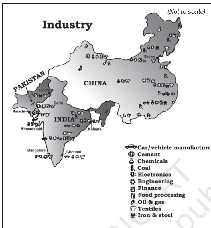
Fig. 10.3 Industry in India, China and Pakistan

China's growth rates, whereas, Pakistan met with drastic decline at 4 per cent. Some scholars hold the reform processes introduced in 1988 in Pakistan and political instability over a long period as reasons behind this trend. We will study in a later section which sector contributed to this trend in these countries.