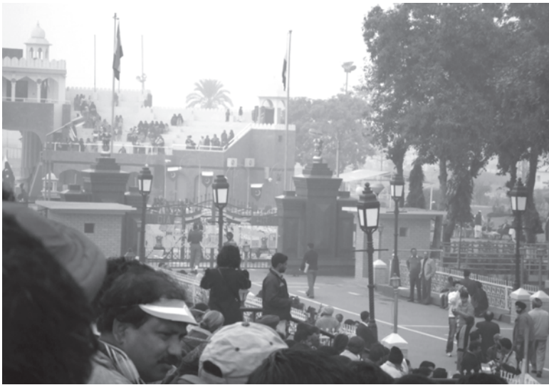
Fig. 10.1 Wagah Border is not only a tourist place but also used for trade between India and Pakistan

goods. At this stage, enterprises owned by government (known as State Owned Enterprises—SOEs), which we, in India, call public sector enterprises, were made to face competition. The reform process also involved dual pricing. This means fixing the prices in two ways; farmers and industrial units were required to buy and sell fixed quantities of inputs and outputs on the basis of prices fixed by the government and the rest were purchased and sold at market prices. Over the years, as production increased, the proportion of goods or inputs transacted in the market also increased. In order to attract foreign investors, special economic zones were set up.