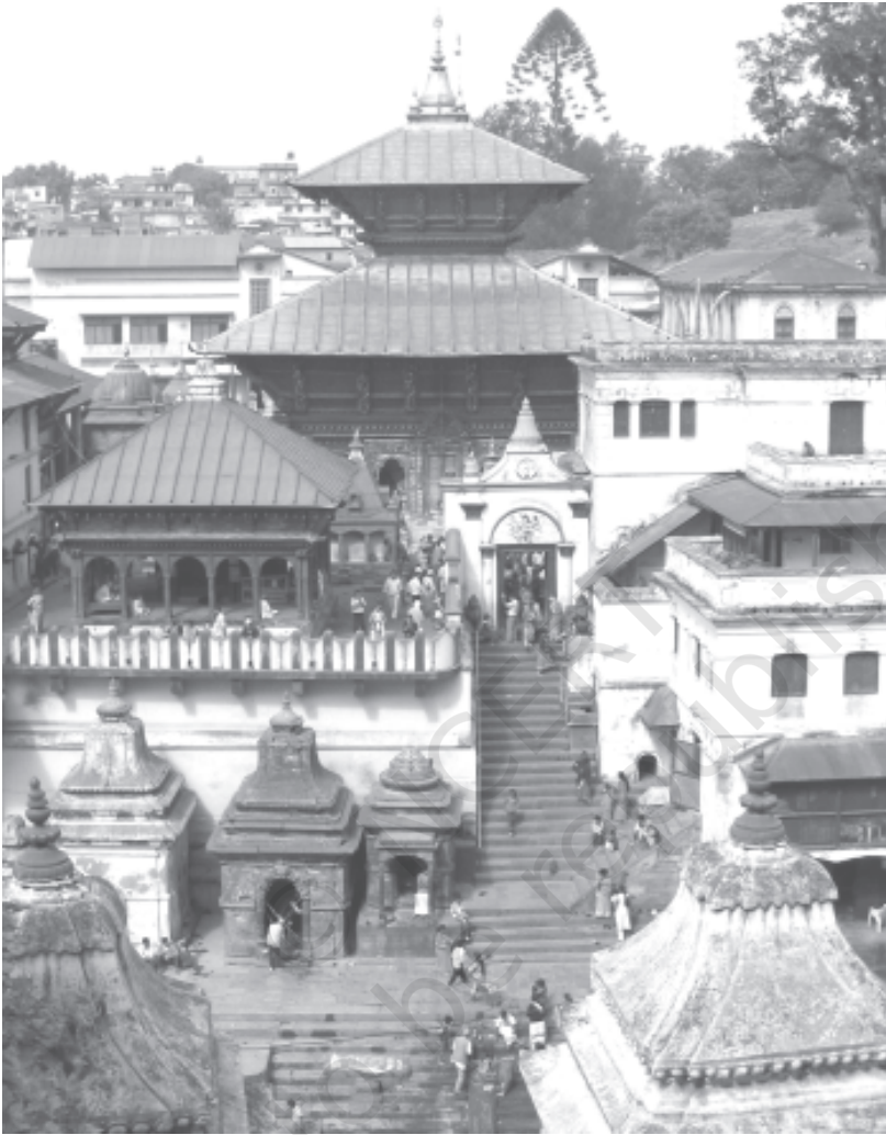
Pashupatinath Temple, Kathmandu

that flows below. A corpse is being cremated on its banks; washerwomen are at their work and children bathe. From a balcony a basket of flowers and leaves, old offerings now wilted, is dropped into the river. A small shrine half protrudes from the stone platform on the river bank. When it emerges fully, the goddess inside will escape, and the evil period of the Kaliyug will end on earth.