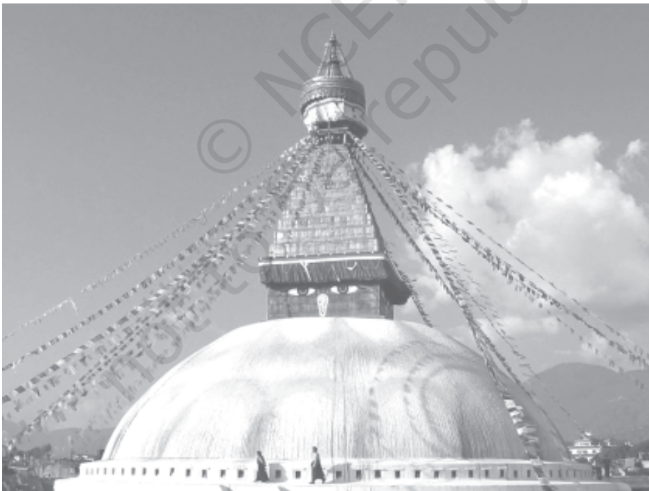
The Baudhnath Stupa, Kathmandu