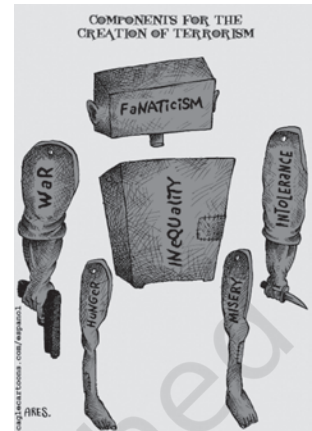
Components for the Creation of Terrorism

List the names of a few Nobel Peace Prize winners. Write a note on any one of them.