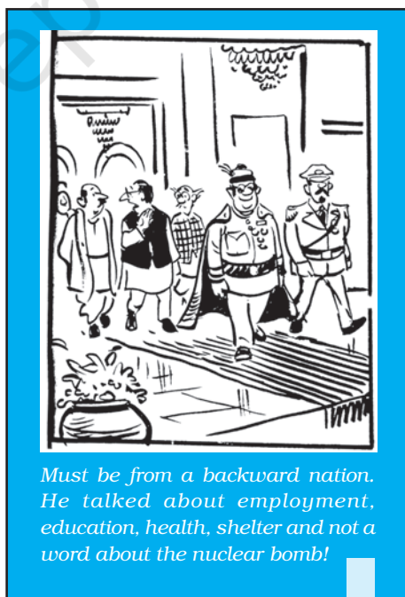
R. K. Laxman in the Times of India

Peace is often defined as the absence of war. The definition is simple but misleading. This is because war is usually equated with armed conflict between countries. However, what happened in Rwanda or Bosnia was not a war of this kind. Yet, it represented a