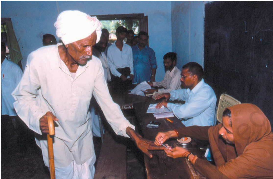
Voting in a rural area: A mark is put on the finger to make sure that a person casts only one vote.

decisions for the entire population. These days a government cannot call itself democratic unless it allows what is known as universal adult franchise. This means that all adults in the country are allowed to vote.