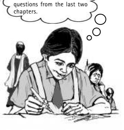
Why was Shabnam happy that she had not watched TV? What would you have done in a similar situation?

From the above discussion, you will understand that the Constitution plays a very important role in democratic societies.