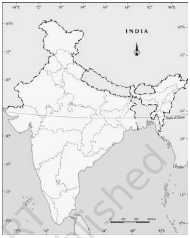
Note: Telangana became the 29th State of India on the 2^{nd} June, 2014, after the reorganisation of the State of Andhra Pradesh.