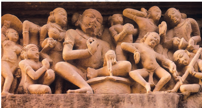
Fig. 5 Dance class, Lakshmana temple, Khajuraho.

who followed the heroic ideal often had to pay for it with their lives.