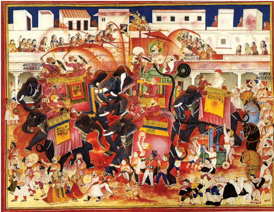
Fig. 8 Maharana Ram Singh II playing holi. Rajput miniature, Kota.

Pradesh. By the late seventeenth century this region had developed a bold and intense style of miniature painting called Basohli. The most popular text to be painted here was Bhanudatta's Rasamanjari . Nadir Shah's invasion and the conquest of Delhi in 1739 resulted in the migration of Mughal artists to the hills to escape the uncertainties of the plains. Here