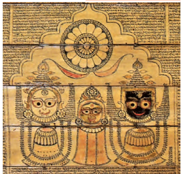
Fig. 2 The icons of Balabhadra, Subhadra and Jagannatha, palm-leaf manuscript, Orissa.

Find out when the language(s) you speak at home were first used for writing.