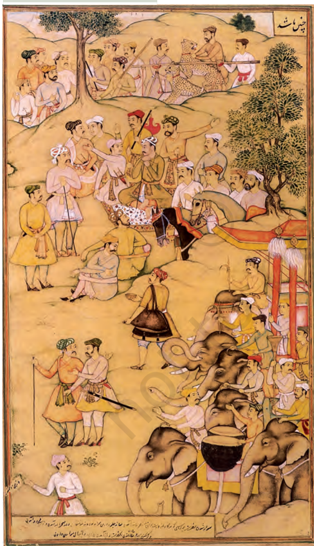
Fig. 7 Akbar resting during a hunt, Mughal miniature.

Another region that attracted miniature paintings was the Himalayan foothills around the modern-day state of Himachal