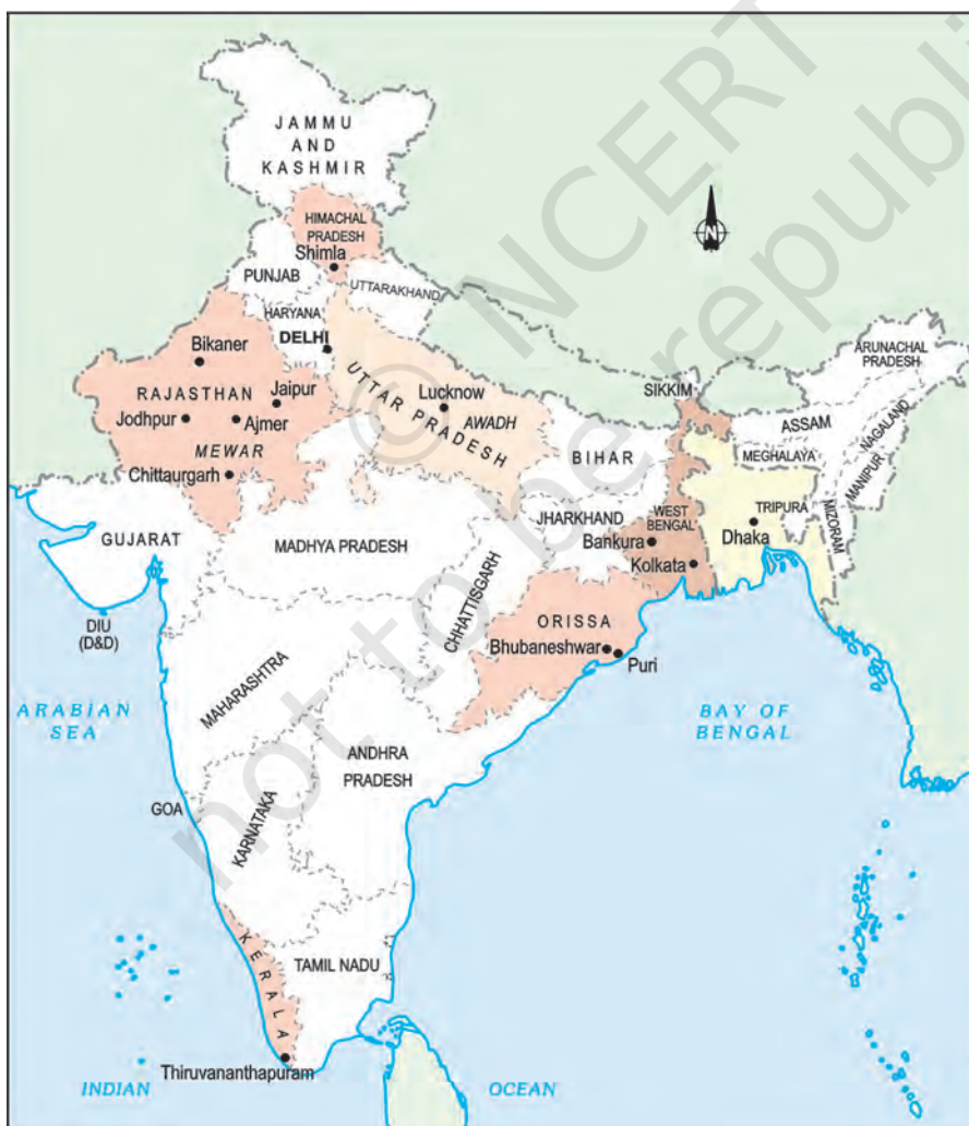
Map 1 Regions discussed in this chapter.

Did women find a place within these stories? Sometimes, they figure as the “cause” for conflicts, as men fought with one another to either “win” or “protect” women. Women are also depicted as following their heroic husbands in both life and death – there are stories about the practice of sati or the immolation of widows on the funeral pyre of their husbands. So those