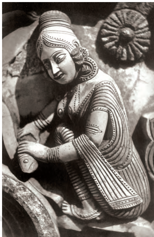
Fig. 14 Fish being dressed for domestic consumption, terracotta plaque from the Vishalakshi temple, Arambagh.

Brahmanas were not allowed to eat non-vegetarian food, but the popularity of fish in the local diet made the Brahmanical authorities relax this prohibition for the Bengal Brahmanas. The Brihaddharma Purana , a thirteenth-century Sanskrit text from Bengal, permitted the local Brahmanas to eat certain varieties of fish.