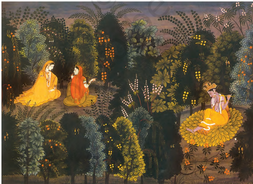
Fig. 9 Krishna, Radha and her companion, Pahari miniature, Kangra.

Pradesh. By the late seventeenth century this region had developed a bold and intense style of miniature painting called Basohli. The most popular text to be painted here was Bhanudatta's Rasamanjari . Nadir Shah's invasion and the conquest of Delhi in 1739 resulted in the migration of Mughal artists to the hills to escape the uncertainties of the plains. Here