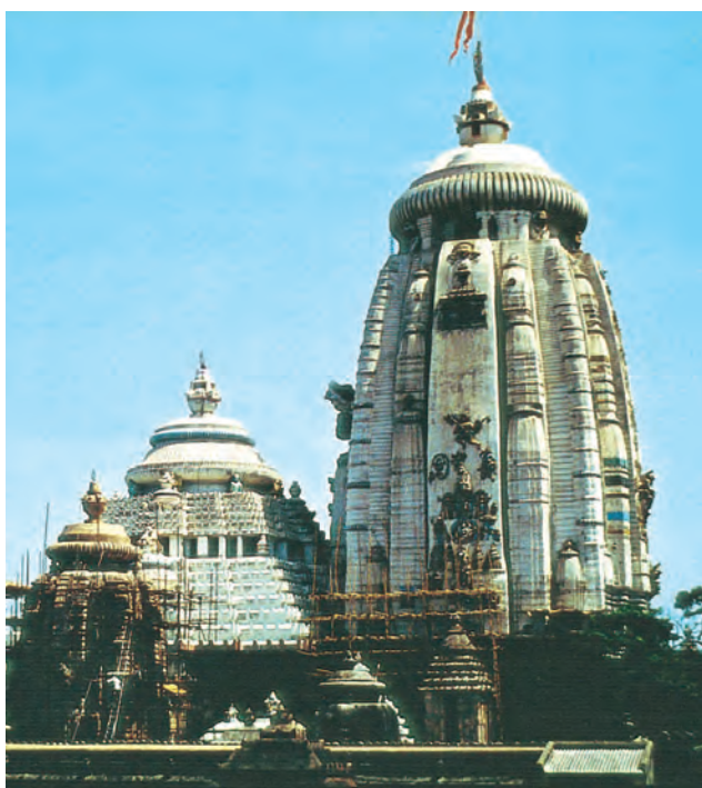
Fig. 3 Jagannatha temple, Puri.

As the temple gained in importance as a centre of pilgrimage, its authority in social and political matters also increased. All those who conquered Orissa, such as the Mughals, the Marathas and the English East India Company, attempted to gain control over the temple. They felt that this would make their rule acceptable to the local people.