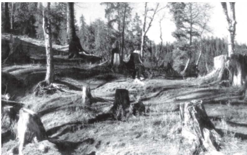
Fig. 9.3 Deforestation leads to land degradation, biodiversity loss and air pollution

India has abundant natural resources in terms of rich quality of soil, hundreds of rivers and tributaries, lush green forests, plenty of mineral deposits beneath the land surface, vast stretch of the Indian Ocean, ranges of mountains, etc. The black soil of the Deccan Plateau is particularly suitable for cultivation of cotton, leading to concentration of textile industries in this region. The Indo-Gangetic plains — spread from the Arabian Sea to the Bay of Bengal — are one of the most fertile, intensively cultivated and densely populated regions in the world. India's forests, though unevenly distributed, provide green cover for a majority of its population and natural cover for its wildlife. Large deposits of iron-ore, coal and natural gas are found in the country. India alone accounts for nearly 20 per cent of the world's total iron-ore reserves. Bauxite, copper, chromate, diamonds, gold, lead, lignite, manganese, zinc, uranium, etc. are also available in different parts of the country. However, the developmental activities in India have resulted in