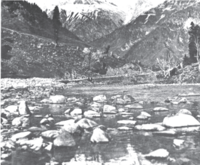
Fig. 9.1 Water bodies: small, snow-fed Himalayan streams are the few fresh-water sources that remain unpolluted.

this results in an environmental crisis. This is the situation today all over the world. The rising population of the developing countries and the affluent consumption and production standards of the developed world have placed a huge stress on the environment in terms of its first two functions. Many resources have become extinct and the wastes generated are beyond the absorptive capacity of the environment. Absorptive capacity means the ability of the environment to