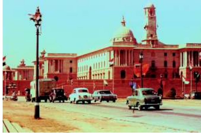
These two buildings of the Central Secretariat, the South Block and North Block were built during the 1930s. The photo on the left is of the South Block which houses the Prime Minister's Office (PMO), the Ministry of Defence and the Ministry of External Affairs. The North Block is the photo on the right and this has the Ministry of Finance and the Ministry of Home Affairs. The other ministries of the Union Government are located in various buildings in New Delhi.

The Rajya Sabha functions primarily as the representative of the states of India in the Parliament. The Rajya Sabha can also initiate legislation and a bill is required to pass through the Rajya Sabha in order to become a law. It, therefore, has an important role of reviewing and altering (if alterations are needed) the laws initiated by the Lok Sabha. The members of the Rajya Sabha are elected by the elected members of the Legislative Assemblies of various states. There are 233 elected members plus 12 members nominated by the President.