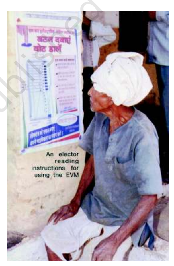
The above photo shows a voter reading instructions on how to use an Electronic Voting Machine (EVM). EVMs were used throughout the country for the first time in the 2004 general elections. The use of EVMs in 2004 saved around 1,50,000 trees which would have been cut to produce about 8,000 tons of paper for printing the ballot papers.

What do you think the artist is trying to convey through the image of Parliament on the previous page?