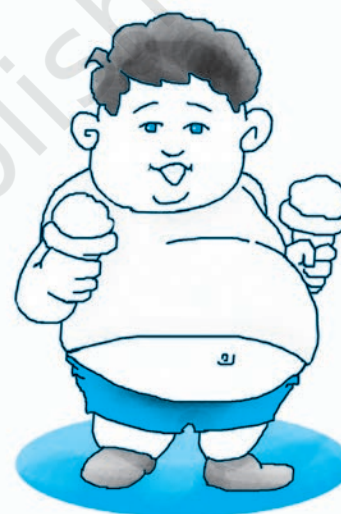
Fig. 11.7 : Over-nutrition