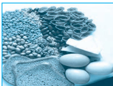
Fig. 11.4 : Calcium rich Diet and Iron rich Diet