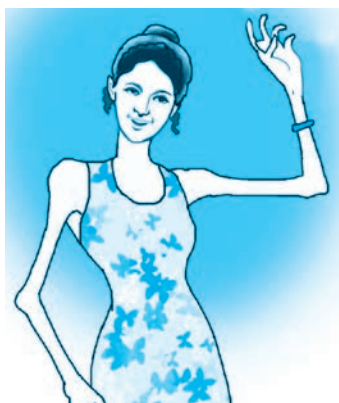
Fig. 11.8 : Anorexia Nervosa