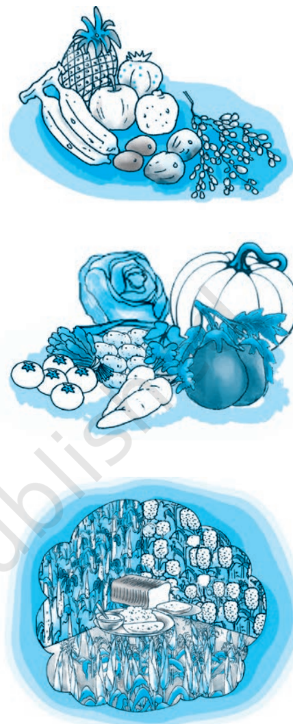
Fig 11.3 : Carbohydrates and Vitamins

Vitamins are organic substances that we require in adequate quantities for good health. Our body, however, cannot synthesise them. Therefore, we need to consume their natural sources such as fruits and vegetables. Vitamins are divided