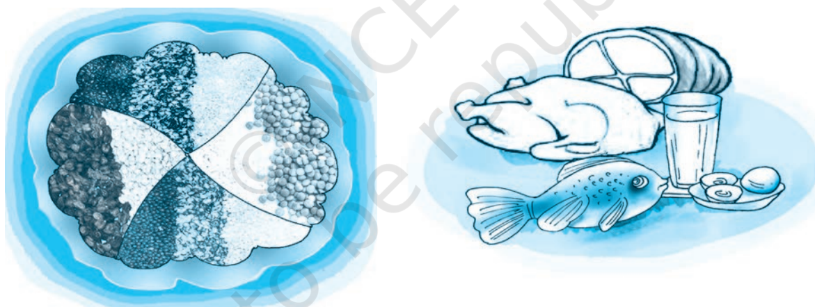
Fig 11.2 : Protein rich food items

The food we consume breaks down to simpler products before it is absorbed and utilised by the body. These simpler substances are called nutrients. Our body utilises nutrients for building and repairing, obtaining energy and for protection from diseases. What is nutrition? The term nutrition is related to our food intake and dietary patterns and utilisation of protein, carbohydrate, fat, vitamins and minerals to maintain our health. Most of the natural food items contain more than one nutrient. Let us understand various nutrients contained in different food items.