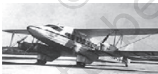
Fig.1.5 Tata Airlines, a division of Tata and Sons, was established in 1932 inaugurating the aviation sector in India

cost to the government exchequer, yet, it failed to compete with the railways, which soon traversed the region running parallel to the canal, and had to be ultimately abandoned. The introduction of the expensive system of electric telegraph in India, similarly, served the purpose of maintaining law and order. The postal services, on the other hand, despite serving a useful public purpose, remained all through