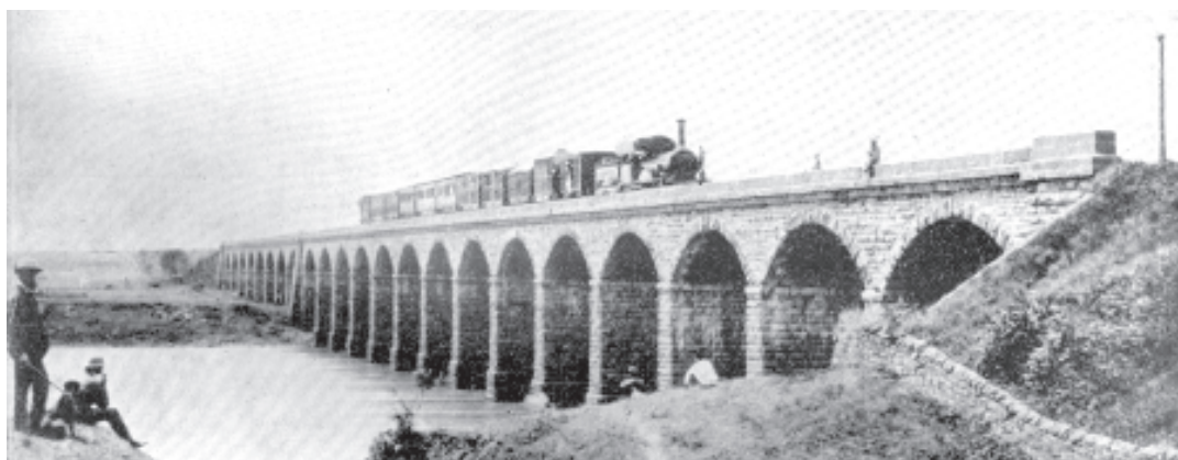
Fig. 1.4 First Railway Bridge linking Bombay with Thane, 1854

Indian people gained owing to the introduction of the railways, were thus outweighed by the country's huge economic loss.