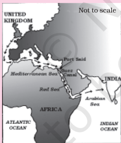
Fig.1.2 Suez Canal: Used as highway between India and Britain

Various details about the population of British India were first collected through a census in 1881. Though suffering from certain limitations, it revealed the unevenness in India's population growth. Subsequently,