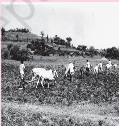
Fig. 1.1 India's agricultural stagnation under the British colonial rule

The French traveller, Bernier, described seventeenth century Bengal in the following way: "The knowledge I have acquired of Bengal in two visits inclines me to believe that it is richer than Egypt. It exports, in abundance, cottons and silks, rice, sugar and butter. It produces amply — for its own consumption — wheat, vegetables, grains, fowls, ducks and geese. It has immense herds of pigs and flocks of sheep and goats. Fish of every kind it has in profusion. From rajmahal to the sea is an endless number of canals, cut in bygone ages from the Ganges by immense labour for navigation and irrigation."