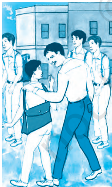
Fig. 2.2 : Parent-child Communication

Anxiety is not abnormal. Everyone gets the feeling of anxiety sometime or the other. Anxiety is an apprehension of something unpleasant or some danger. It causes mental discomfort and pain. It may sometimes prove to be useful, for example, before an examination or competition. But an abnormally high level of anxiety is counter productive as it distracts and lowers the span of attention. Adolescents sometimes panic out of anxiety without knowing the reason. They may even feel a fear of failure in future. This makes them tense and tired. Anxiety may