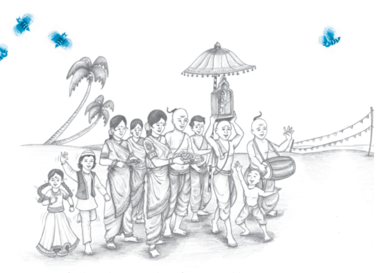
Our family used to arrange boats for carrying idols of the Lord from the temple to the marriage site.

father; Aravindan went into the business of arranging transport for visiting pilgrims; and Sivaprakasan became a catering contractor for the Southern Railways.