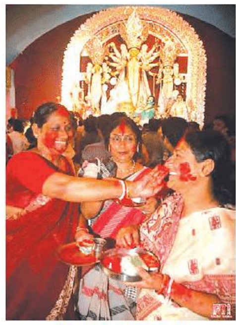
Durga Puja Festival

Kolkata, land of Goddess Kali, is known for creative activities like dance, drama, music, art, painting and literature. Durga Puja is celebrated more culturally and in known as the rich festival of Kolkata. Every year this festival is celebrated with full of excitement.