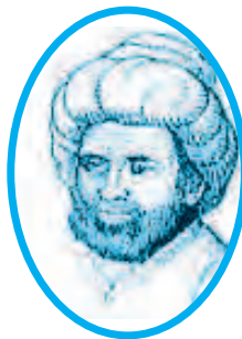
Muhammad ibn Musa al-Khwarizmi (C.E. 780 – 850)

A lemma is a proven statement used for proving another statement.