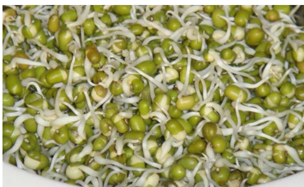
Fig 2.10: Germination

Whole pulses are soaked overnight, water should be drained away and the seeds should be tied in a loosely woven cloth and hung. Water should be sprinkled twice or thrice in a day. In a day or two, germination takes place.