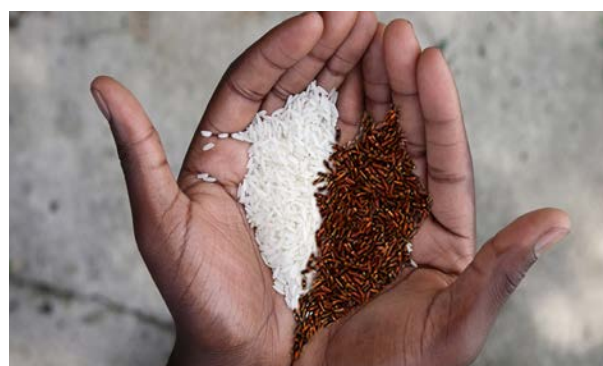
Fig 2.2: Rice