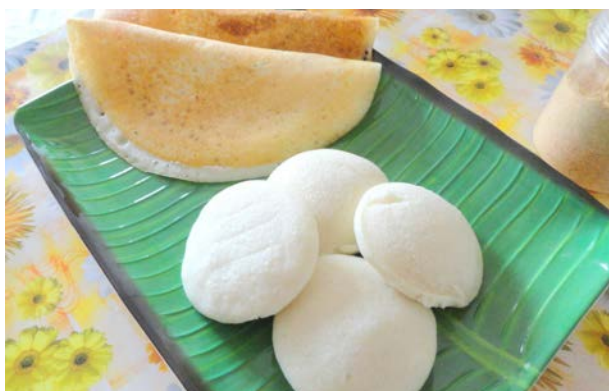
Fig 2.9: Fermented cereal products (Idli and Dosai)