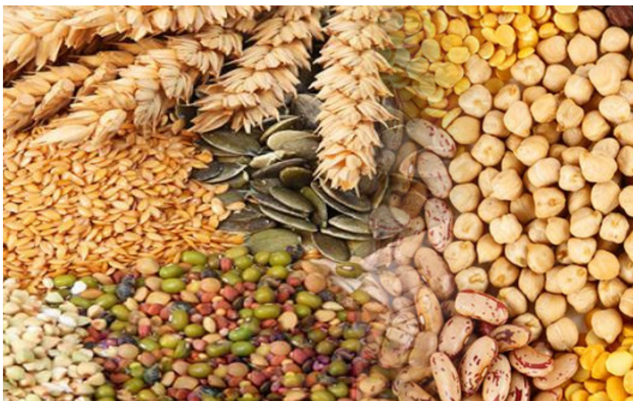
Cereals and pulses