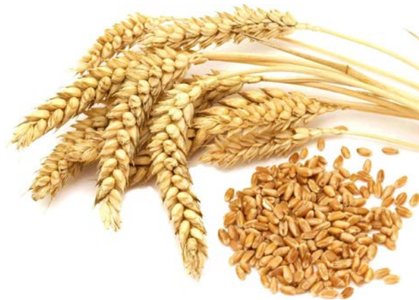
Fig 2.4: Wheat

Wheat is milled to produce flour which is used to make a variety of products including bread across the world. Wheat contains a protein called gluten which is necessary for the basic structure in forming the dough system for bread, rolls and other