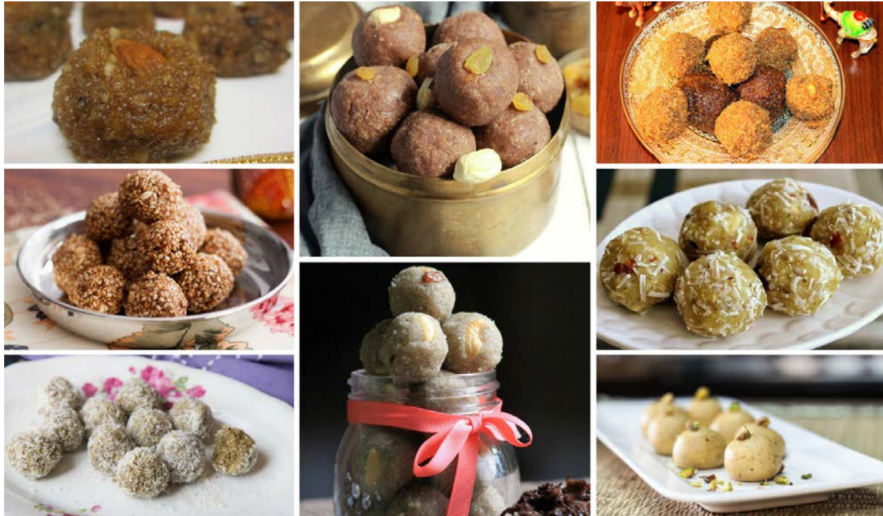
Fig 2.7: Sweets and savouries - Millets

5. Prevent cancer: Research shows that fibre is the simplest way to prevent the outbreak of breast cancer in women. Since millets are rich in fiber, it can prevent occurrence of breast cancer.