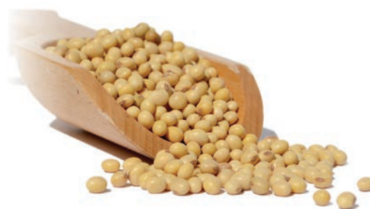
Fig 2.11: Soya