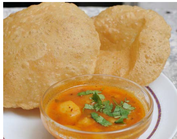
Fig 2.8: Gluten formation (Chapathi and Poori)