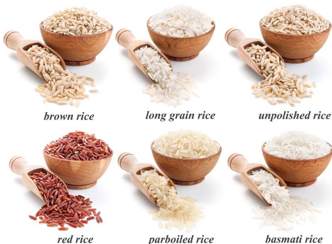
Fig 2.3: Types of rice