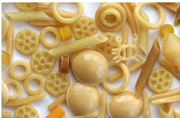
Fig 2.5: Macaroni

Macaroni products: These products are also called pasta. These products include macaroni, spaghetti, vermicelli and noodles.