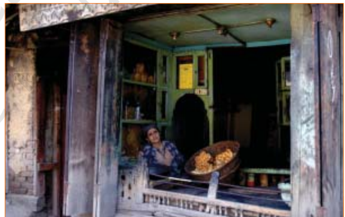
Can you tell what is shown in this picture? Every lane in Kashmir has a bakery. Kashmiri people don't cook roties in their homes, they buy it from such bakeries.

After a long journey Loner and I were about to reach Mumbai. My heart felt heavy. I also felt that my motorcycle did not want to come back. I was happy that I had learnt and experienced so many new things. I had also brought back some memories in my camera. And of course, this was not the end! Next time when Loner and I get bored of the city, we will again set out for a new journey!