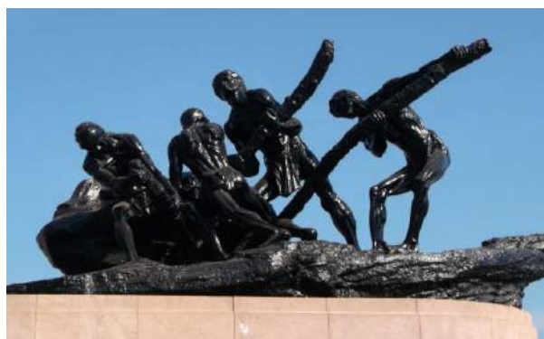
Labour Statue in Marina Beach

The First World War (1914–18) provided stimulus to industrial growth in India. These industries, catering to war time needs, had employed a huge number of workers. At the end of the War there were retrenchments across the industries, as the war time requirements receded. Combined with high prices, this gave a momentum to the labour movement. B.P. Wadia, M. Singaravelar, Thiru. Vi. Kalyanasundaram and others initiated the formation of labour unions in the Madras Presidency. In 1918, India’s first organised trade union, the Madras Labour Union, was formed.