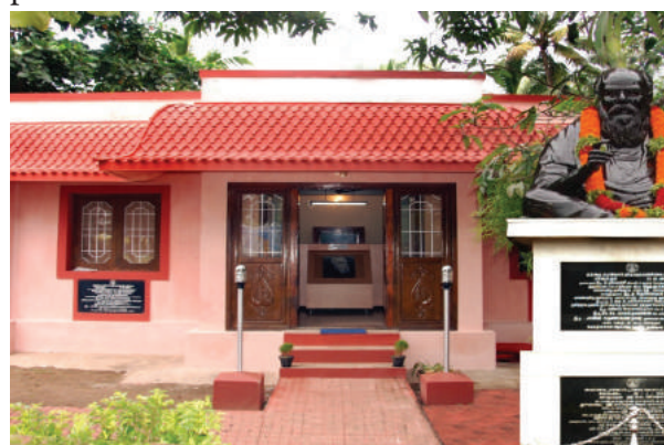
Thanthai Periyar Memorial (Vaikom, Kerala)