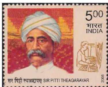
Sir Pitti Theyagarayar

The first election, under the Montagu-Chelmsford Reforms, was held in 1920 after the introduction of the Dyarchy form of government in the provinces. The Justice Party won the election and formed the first-ever Indian cabinet in Madras. A. Subbarayalu became the Chief Minister of the Madras Presidency and the party formed the government during 1920–1923 and 1923–1926. In the context of