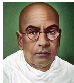
Thiru. Vi. Ka