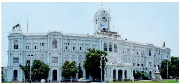
Corporation of Chennai

Name the British Viceroy after whom the building of Chennai Corporation is name.