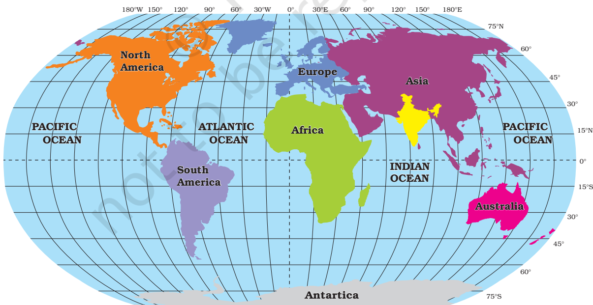
Figure 1.1 : India in the World

The land mass of India has an area of 3.28 million square km. India's total area accounts for about 2.4 per cent of the total geographical