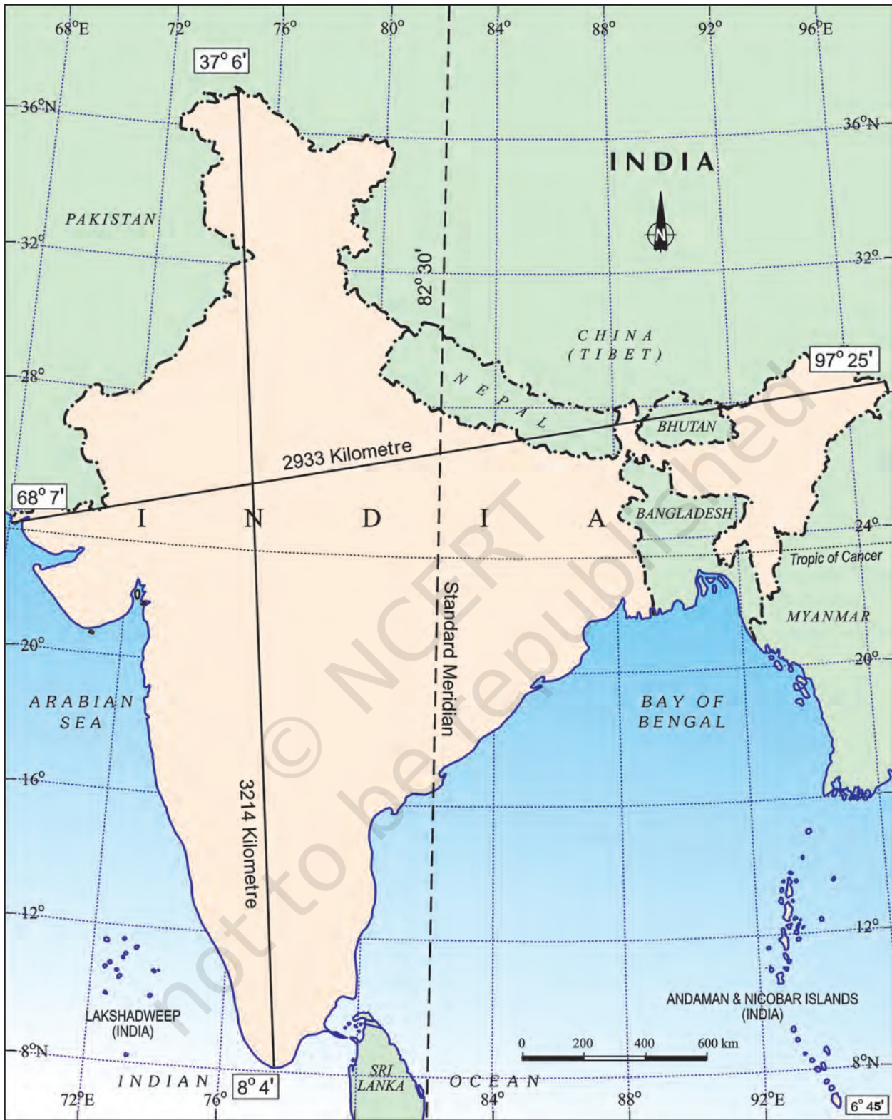
Figure 1.3 : India : Extent and Standard Meridian