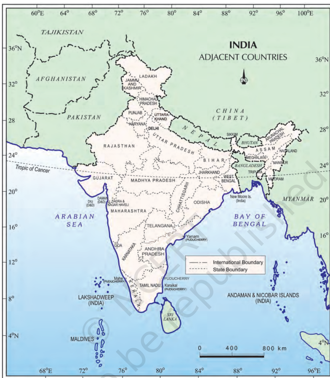
Figure 1.5 : India and Adjacent Countries

Sri Lanka and Maldives. Sri Lanka is separated from India by a narrow channel of sea formed by the Palk Strait and the Gulf of Mannar, while Maldives Islands are situated to the south of the Lakshadweep Islands.