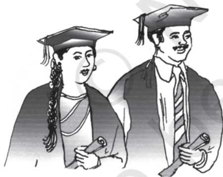
Fig. 5.7 Higher Education: few takers

The differences in literacy rates between males and females are narrowing signifying a positive development in gender equity; still the need to promote education for women in India is imminent for various reasons such as improving economic independence and social status of women and also because women education makes a favourable impact on fertility rate and health care of women and children. Therefore, we cannot be complacent about the upward movement in the literacy rates and we have miles to go in achieving cent per cent adult literacy.