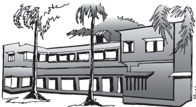
Fig. 5.5 Investment in educational infrastructure is inevitable

One can understand the inadequacy of the expenditure on education if we compare it with the desired level of education expenditure as recommended by the various commissions. The Education Commission (1964–66) had recommended that at least 6 per cent of GDP be spent on education so as to make a noticeable rate of growth in educational achievements. The Tapas Majumdar Committee, appointed by the Government of India in 1999, estimated an expenditure of around Rs