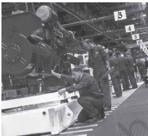
Fig. 5.3 Scientific and technical manpower: a rich ingredient of human capital

Empirical evidence to prove that increase in human capital causes economic growth is rather nebulous. This may be because of measurement problems. For example, education measured in terms of years of schooling, teacher-pupil ratio and enrolment rates may not reflect the quality of education; health services measured in monetary terms, life expectancy and mortality rates may not reflect the true health status of the people in a country. Using the indicators mentioned above, an analysis of improvement in education and health sectors and growth in real per capita income in both developing and developed countries shows that there is convergence in the measures of human capital but no sign of convergence of per capita real income. In other words, the human capital growth in developing countries has been faster but the growth of per capita real income has not been that fast. There are reasons to believe that the