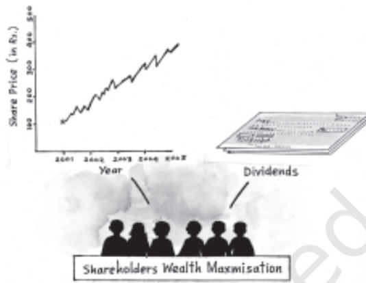
Wealth Maximisation Concept

Investment decision can be long-term or short-term. A long-term investment decision is also called a Capital Budgeting decision . It involves committing the finance on a long-term basis. For example, making investment in a new machine to replace an existing one or acquiring a new fixed asset or opening a new branch, etc. These decisions are very crucial for any business since they affect its earning capacity in the long run. The size of assets, profitability and competitiveness are all affected by capital budgeting decisions. Moreover, these decisions normally involve huge amounts of investment and are irreversible except at a huge cost. Therefore, once made, it is often almost impossible for a business to wriggle out of such decisions. Therefore, they need to be taken with utmost care. These