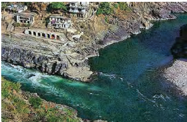
Figure 3.5 : Confluence of Bhagirathi and Alaknanda at Devaprayag

The Ganga is joined by many tributaries from the Himalayas, a few of them being major rivers, such as the Yamuna, the Ghaghara, the Gandak and the Kosi. The river Yamuna rises from the Yamunotri Glacier in the Himalayas. It flows parallel to the Ganga and as a right bank tributary meets the Ganga at Allahabad. The Ghaghara, the Gandak and the Kosi rise in the Nepal Himalaya. They are the rivers, which flood parts of the northern plains every year, causing widespread damage to life and property, whereas, they enrich the soil for agricultural use.