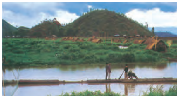
Figure 3.6 : Loktak Lake

Most of the freshwater lakes are in the Himalayan region. They are of glacial origin. In other words, they formed when glaciers dug out a basin, which was later filled with snowmelt. The Wular lake in Jammu and Kashmir, in contrast, is the result of tectonic activity. It is the largest freshwater lake in India. The Dal lake, Bhimtal, Nainital, Loktak and Barapani are some other important freshwater lakes.