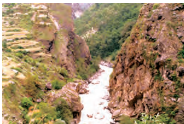
Figure 3.2 : A Gorge

Apart from originating from the two major physiographic regions of India, the Himalayan and the Peninsular rivers are different from each other in many ways. Most of the Himalayan rivers are perennial . It means that they have water throughout the year. These rivers receive water from rain as well as from melted snow from the lofty mountains. The two major Himalayan rivers, the Indus and the Brahmaputra originate from the north of the mountain ranges. They have cut through the mountains making gorges. The Himalayan rivers have long courses from their source to the sea.