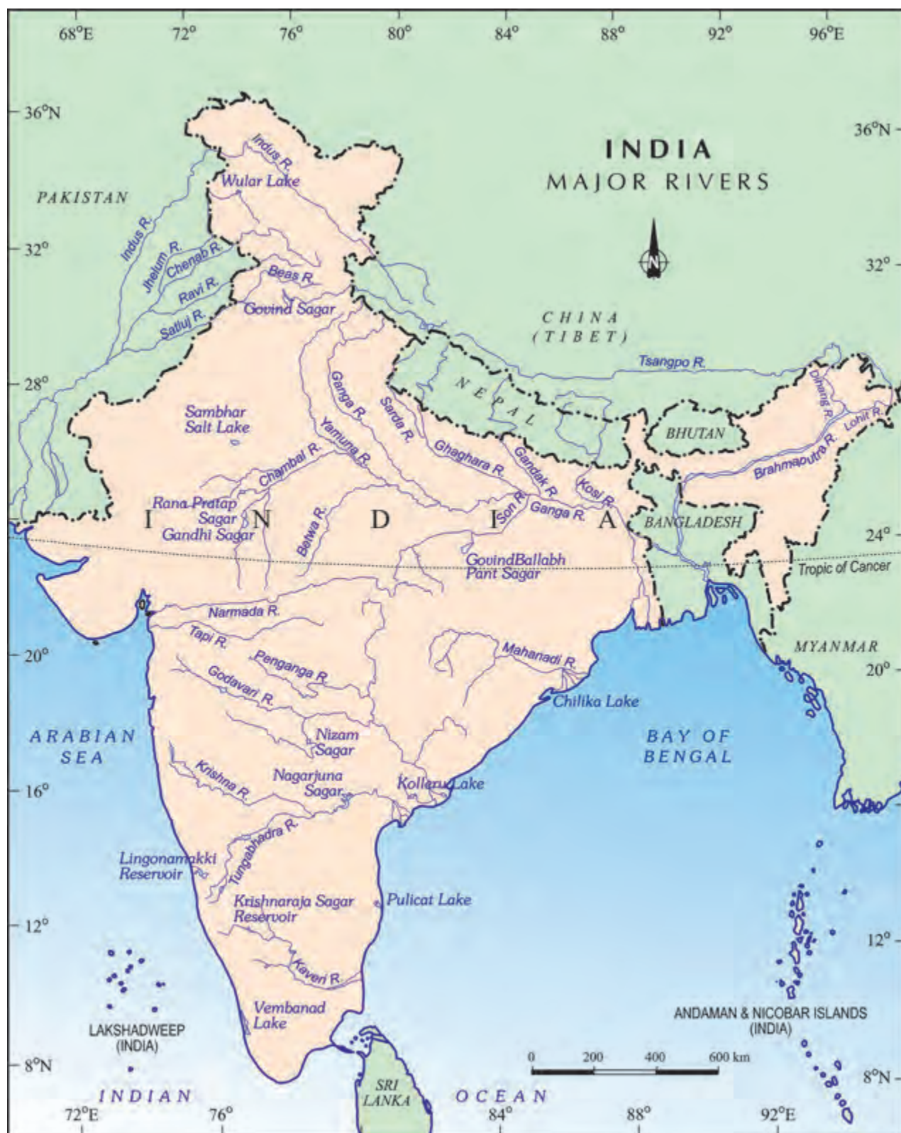
Figure 3.4 : Major Rivers and Lakes