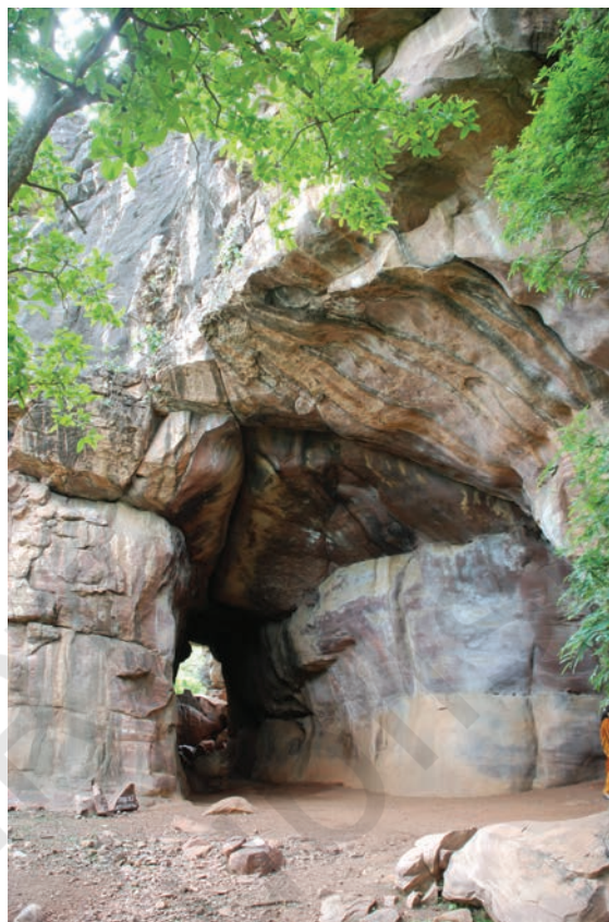
Cave entrance, Bhimbetka, Madhya Pradesh

The paintings of the Upper Palaeolithic phase are linear representations, in green and dark red, of huge animal figures, such as bisons, elephants, tigers, rhinos and boars besides stick-like human figures. A few are wash paintings but mostly they are filled with