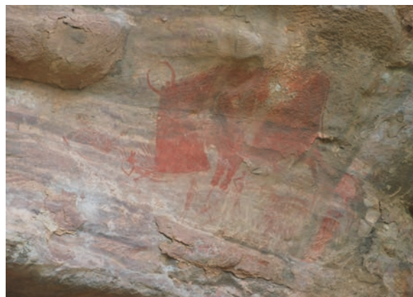
Painting showing a man being hunted by a beast, Bhimbetka

made out of limestone. The rock of mineral was first ground into a powder. This may then have been mixed with water and also with some thick or sticky substance such as animal fat or gum or resin from trees. Brushes were made of plant fibre. What is amazing is that these colours have survived thousands of years of adverse weather conditions. It is believed that the colours have remained intact because of the chemical reaction of the oxide present on the surface of the rocks.