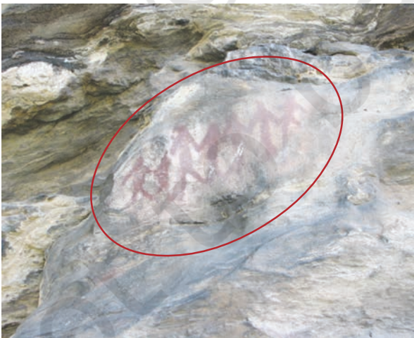
Hand-linked dancing figures, Lakhudiyar, Uttarakhand

Remnants of rock paintings have been found on the walls of the caves situated in several districts of Madhya Pradesh, Uttar Pradesh, Andhra Pradesh, Karnataka and Bihar. Some paintings have been reported from the Kumaon hills in Uttarakhand also. The rock shelters on banks of the River Suyal at Lakhudiyar, about twenty kilometres on the Almora–Barechana road, bear these prehistoric paintings. Lakhudiyar literally means one lakh caves. The paintings here can be divided into three categories: man, animal and geometric patterns in white, black and red ochre. Humans are represented in stick-like forms. A long-snouted animal, a fox and a multiple legged lizard are the main animal motifs. Wavy lines, rectangle-filled geometric designs, and groups of dots can also be seen here. One of the interesting scenes depicted here is of hand-linked dancing human figures. There is some superimposition of paintings. The earliest are in black; over these are red ochre paintings and the last group comprises white paintings. From Kashmir two slabs with engravings have been reported. The granite rocks of Karnataka and Andhra Pradesh provided suitable canvases to the Neolithic man for his paintings. There are several such sites but more famous among them are Kupgallu, Piklihal and Tekkalkota. Three types of paintings have been reported from here—paintings in white, paintings in red ochre over a white background and paintings in red ochre. These