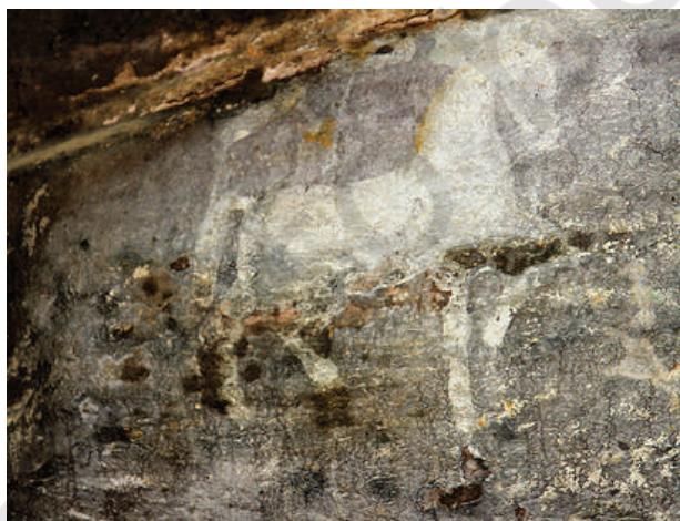
One of the few images showing only one animal, Bhimbetka

The artists of Bhimbetka used many colours, including various shades of white, yellow, orange, red ochre, purple, brown, green and black. But white and red were their favourite colours. The paints were made by grinding various rocks and minerals. They got red from haematite (known as geru in India). The green came from a green variety of a stone called chalcedony. White might have been