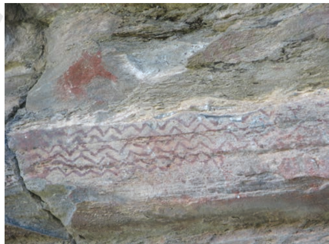
Wavy lines, Lakhudiyar, Uttarakhand