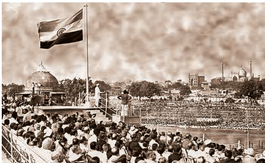
Pt. Nehru delivering an Independence Day speech

Songs and symbols that emerged during the freedom struggle serve as a constant reminder of our country's rich tradition of respect for diversity. Do you know the story of the Indian flag? It was used as a symbol of protest against the British by people everywhere.