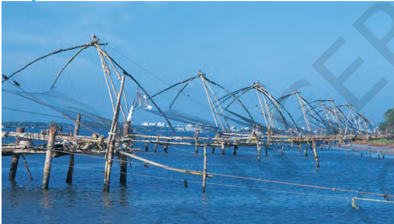
Chinese Fishing Nets

Kerala is a state in the south-west corner of India. It is surrounded by the sea on one side and hills on the other. A number of spices like pepper, cloves and cardamoms are grown on the hills. It is spices that made this region