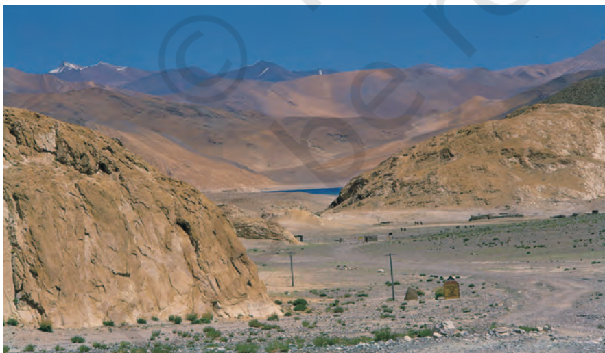
The dry barren landscape of the mountainous desert of Ladakh.

Ladakh is a desert in the mountains in the east of Jammu and Kashmir. Very little agriculture is possible here since this region does not receive any rain and is covered in snow for a large part of the year. There are very few trees that can grow in the region. For drinking water, people depend on the melting snow during the summer months.