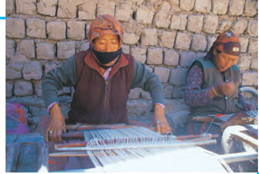
Woman weaving a pashmina shawl

an attractive place for traders. Jewish and Arab traders were the first to come here. The Apostle of Christ, St. Thomas is believed to have come here nearly