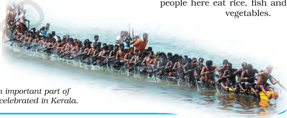
The boat race is an important part of the Onam festival celebrated in Kerala.

Even the utensil used for frying is called the cheenachatti , and it is believed that the word cheen could have come from China. The fertile land and climate are suited to growing rice and a majority of people here eat rice, fish and vegetables.