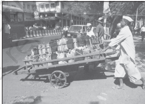
Fig. 7.4: Dabbawala Service in Mumbai

Personal services are made available to the people to facilitate their work in daily life. The workers migrate from rural areas in search of employment and are unskilled. They are employed in domestic services as housekeepers, cooks, and gardeners. This segment of workers is generally unorganised. One such example in India is Mumbai's dabbawala (Tiffin) service provided to about 1,75,000 customers all over the city.