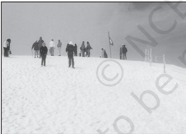
Fig. 7.5: Tourists skiing in the snow capped mountain slopes of Switzerland

Tourism is travel undertaken for purposes of recreation rather than business. It has become the world's single largest tertiary activity in total registered jobs (250 million) and total revenue (40 per cent of the total GDP). Besides, many local persons, are employed to provide services like accommodation, meals, transport, entertainment and special shops serving the tourists. Tourism fosters the growth of infrastructure industries, retail trading, and craft industries (souvenirs). In some regions, tourism is seasonal because the vacation period is dependent on favourable weather conditions, but many regions attract visitors all the year round.