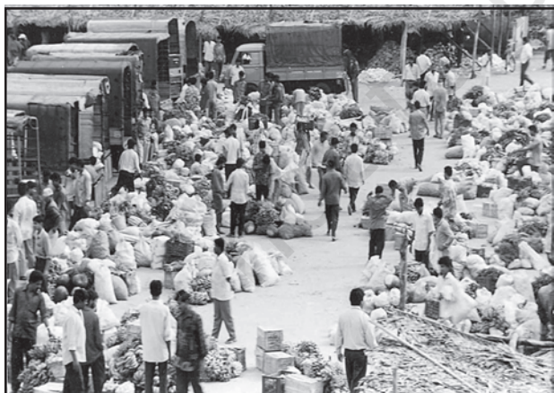
Fig. 7.2: A Wholesale Vegetable Market

Rural marketing centres cater to nearby settlements. These are quasi-urban centres. They serve as trading centres of the most rudimentary type. Here personal and professional services are not well-developed. These form local collecting and distributing centres. Most of these have mandis (wholesale markets) and also retailing areas. They are not urban centres per se but are significant centres for making available goods and services which are most frequently demanded by rural folk.