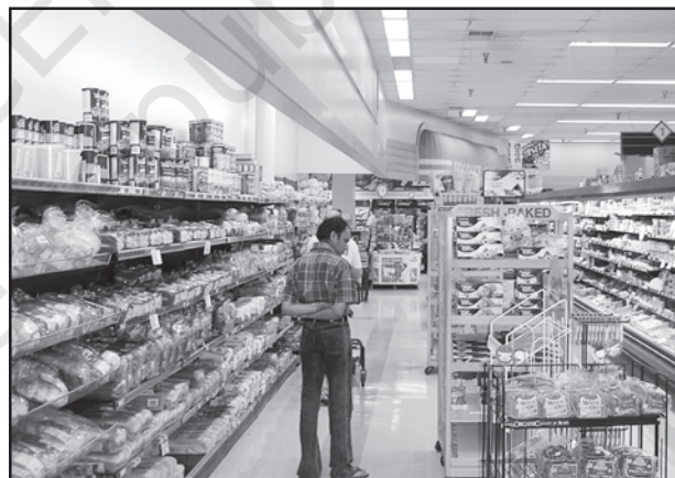
Fig. 7.3: Packed Food Market in U.S.A.

Urban marketing centres have more widely specialised urban services. They provide ordinary goods and services as well as many of the specialised goods and services required by people. Urban centres, therefore, offer manufactured goods as well as many specialised markets develop, e.g. markets for labour, housing, semi or finished products. Services of educational institutions and professionals such as teachers, lawyers, consultants, physicians, dentists and veterinary doctors are available.