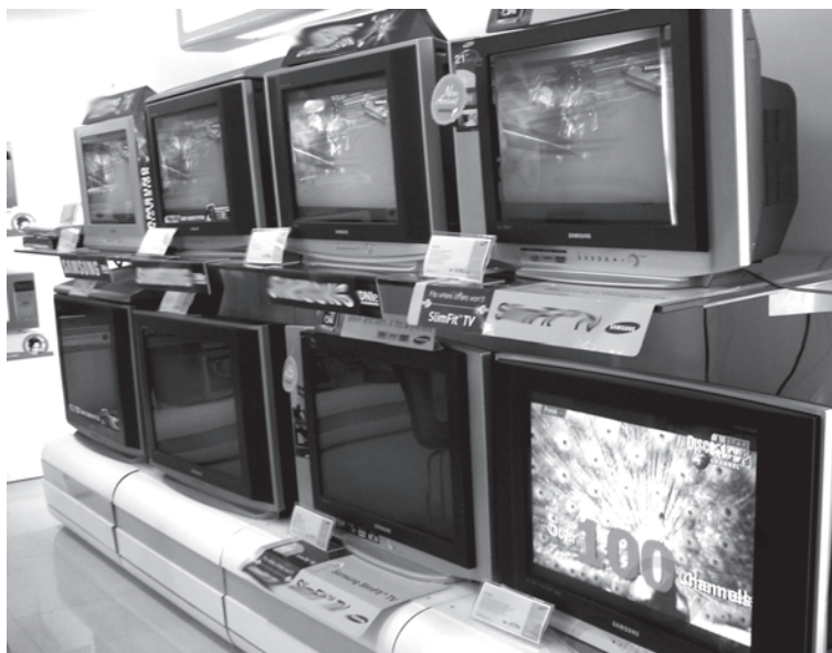
A television showroom

In 1991 there was one state controlled TV channel Doordarshan in India. By 1998 there were almost 70 channels. Privately run satellite channels have multiplied rapidly since the mid-1990s. While Doordarshan broadcasts over 20 channels there were some 40 private television networks broadcasting in 2000. The staggering growth of private satellite television has been one of the defining developments of contemporary India. In 2002, 134 million individuals watched satellite TV on an average every week. This number went up to 190 million in 2005. The number of homes with access to satellite TV has jumped from 40 million in 2002 to 61 million in 2005. Satellite subscription has now penetrated 56 percent of all TV homes.