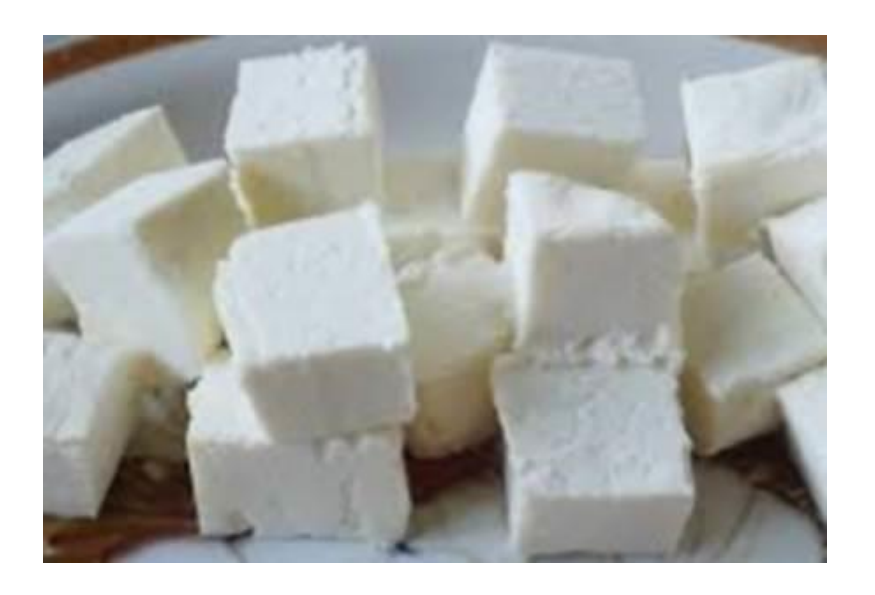
Butter Butter is a dairy product containing