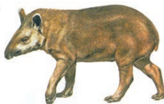
Fig. 8.5 : Tapir

are found here (Fig. 8.5). Various species of reptiles and snakes also thrive in these jungles. Crocodiles, snakes, pythons abound. Anaconda and boa constrictor are some of the species. Besides, the basin is home to thousands of species of insects. Several species of fishes including the flesh-eating Piranha fish is also found in the river. This basin is thus extraordinarily rich in the variety of life found there.