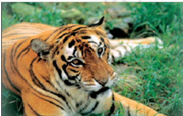
Fig. 8.14: Tiger in Manas Wildlife sanctuary

All the four ways of transport are well developed in the Ganga-Brahmaputra basin. In the plain areas the roadways and railways transport the people from one place to another. The waterways, is an effective means of transport particularly along the rivers. Kolkata is an important port on the River Hooghly. The plain area also has a large number of airports.