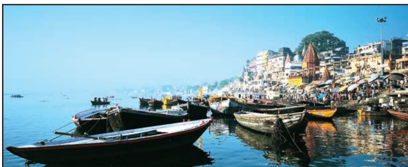
Fig. 8.13: Varanasi along the River Ganga

The Ganga-Brahmaputra plain has several big towns and cities. The cities of Allahabad, Kanpur, Varanasi, Lucknow, Patna and Kolkata all with the population of more than ten lakhs are located along the River Ganga (Fig. 8.13). The wastewater from these towns