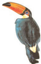
Fig. 8.4 : Toucans

The rainforest is rich in fauna. Birds such as toucans (Fig. 8.4), humming birds, bird of paradise with their brilliantly coloured plumage, oversized bills for eating make them different from birds we commonly see in India. These birds also make loud sounds in the forests. Animals like monkeys, sloth and ant-eating tapirs