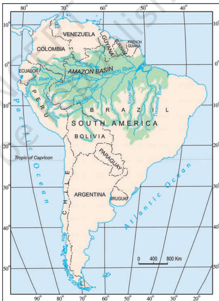
Fig. 8.2: The Amazon Basin in South America

Name the countries of the basin through which the equator passes.