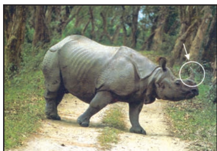
Fig. 8.11 : One horned rhinoceros

There is a variety of wildlife in the basin. Elephants, tigers, deer and monkeys are common. The one-horned rhinoceros is found in the Brahmaputra plain. In the delta area, Bengal tiger, crocodiles and alligator are found. Aquatic life abounds in the fresh river waters, the lakes and the Bay of Bengal Sea. The most popular varieties of the fish are the rohu, catla and hilsa. Fish and rice is the staple diet of the people living in the area.