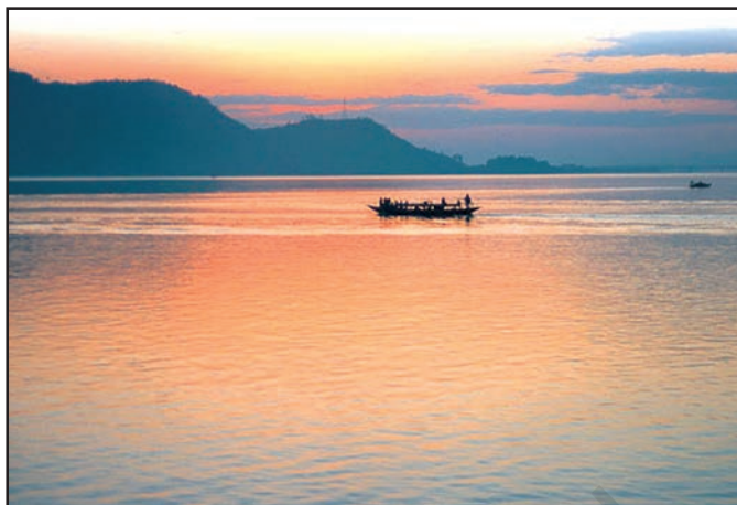
Fig. 8.7 Brahmaputra river

The plains of the Ganga and the Brahmaputra, the mountains and the foothills of the