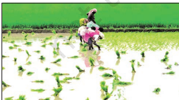
Fig. 8.9 : Paddy Cultivation

The vegetation cover of the area varies according to the type of landforms. In the Ganga and Brahmaputra plain tropical deciduous trees grow, along with teak, sal and peepal. Thick bamboo groves are common in the Brahmaputra plain. The delta area is covered with the