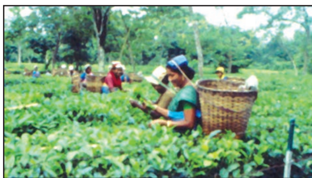
Fig. 8.10 : Tea Garden in Assam