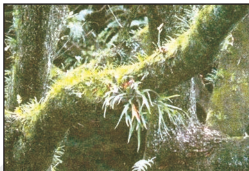
Fig. 8.3 : The Amazon Forest

As it rains heavily in this region, thick forests grow (Fig. 8.3). The forests are in fact so thick that the dense “roof” created by leaves and branches does not allow the sunlight to reach the ground. The ground remains dark and damp. Only shade tolerant vegetation may grow here. Orchids, bromeliads grow as plant parasites.