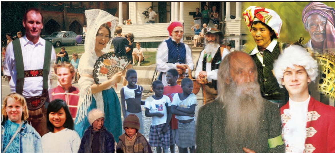
Fig. 8.1: People from various parts of the world

Renuka was excited. Shrikant Uncle was home after a gap of nearly four months. He was a wildlife photographer and travelled widely. Renuka's interest in wildlife and forests began at an early age, when her uncle introduced her to books on nature. Pictures of distant lands and people, who lived there, always fascinated her.