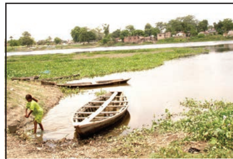
A Polluted Lake

to sell in the market. They have even begun supply to the neighbouring town. The community is living in harmony with nature. As long as the pollutants from nearby towns do not find their way into the lake waters, the fish cultivation will not face any threat.