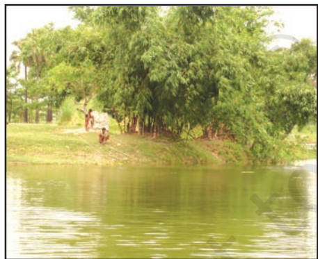
A clean lake

Binod is a fisherman living in the Matwali Maun village of Bihar. He is a happy man today. With the efforts of the fellow fishermen – Ravindar, Kishore, Rajiv and others, he cleaned the maun or the ox-bow lake to cultivate different varieties of fish. The local weed (vallisneria, hydrilla) that grows in the lake is the food of the fish. The land around the lake is fertile. He sows crops such as paddy, maize and pulses in these fields. The buffalo is used to plough the land. The community is satisfied. There is enough fish catch from the river – enough fish to eat and enough fish