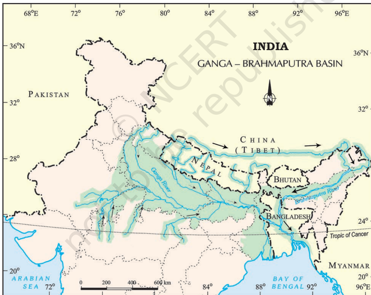
Fig. 8.8: Ganga-Brahmaputra Basin