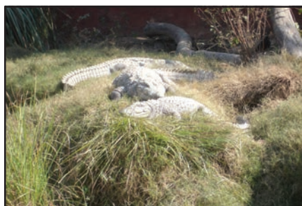
Fig. 8.12 : Crocodiles