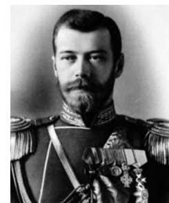
Tsar Nicholas II

Tsar Nicholas II of Romanov dynasty had little experience of government. His wife Tsarina Alexandra was a dominant personality and Nicholas was under her strong influence. Determined that Russia