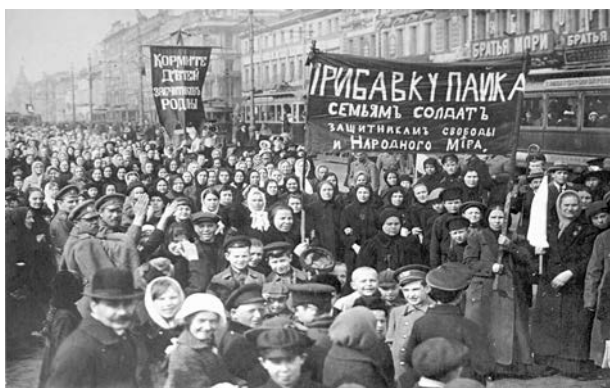
Revolution of 1917

The bread shortages among women textile workers, many with husbands in the army, forced them to go on strike anyway and march through the factory areas of Petrograd, the capital of the Russian Empire. Masses of women workers demanding "Bread for workers" waved their arms towards factory workers and shouted "Come out!" "Stop work!" The city's 400,000 workers joined the movement the next day (24 February).