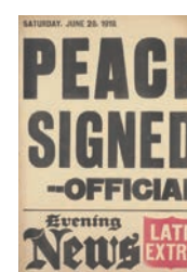
A News paper Report

The Peace Conference opened in Paris in January 1919, two months after the signing of the armistice. Woodrow Wilson (USA), Lloyd George (Prime Minister of England) and Clemenceau (Prime Minister