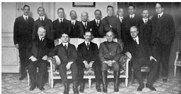
Paris Peace Conference

of France) played a very important part in the deliberations.