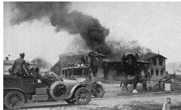
Battle of Tannenberg

the Germans. Paris was thus saved. The battle of Marne is a memorable for trench warfare .