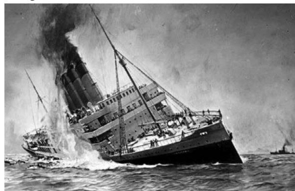
Sinking of Lusitania

In 1916 a naval battle ( Battle of Jutland ) had taken place in the North Sea. The British won the battle. Thereafter Germany started their submarine warfare and their cruisers went roaming about, interfering with the shipping of the Allies. One of these was the famous Emden, which bombarded Madras. As a counter measure to the blockade the Germans proclaimed in January 1917 that they would sink even neutral ships in certain waters. Lusitania , an American ship, was torpedoed by a German submarine. There was a lot of resentment in the USA and President Wilson declared war against Germany in April 1917. America's entry with its enormous resources made Allied victory a foregone conclusion.