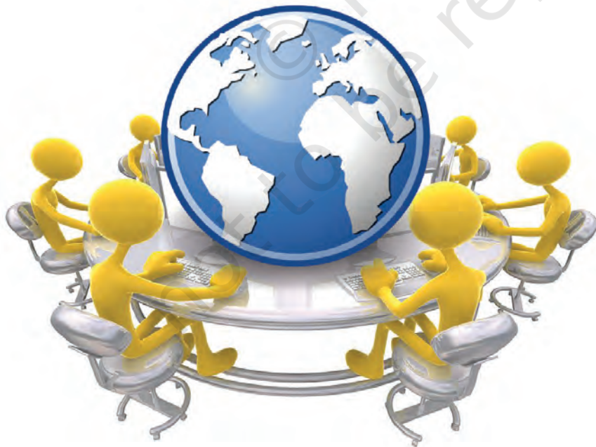
Fig. 7.1: Cyber World

Since childhood our parents and elders have been guiding and suggesting us to take care of our eating habits, practice hygiene, be wary of strangers, communicate effectively and so on to ensure that we develop into confident, strong and positive individuals who are able to cope up with the competition and complexities of the real world. With the advent of