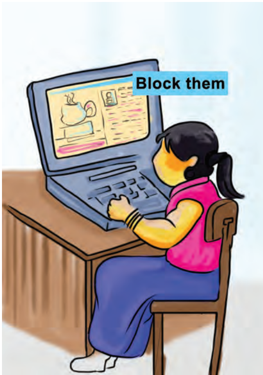
Fig. 7.5: Block

Take a screenshot of anything that you think could be cyber bullying and keep a record of it.