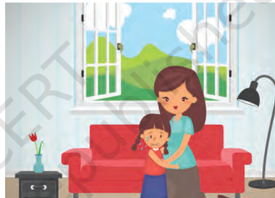
Fig. 7.6: Talk about it

Cyber bullying may affect you in many different ways. Don't feel that you are alone. Let your parents and teachers know what is going on. Never keep it to yourself.