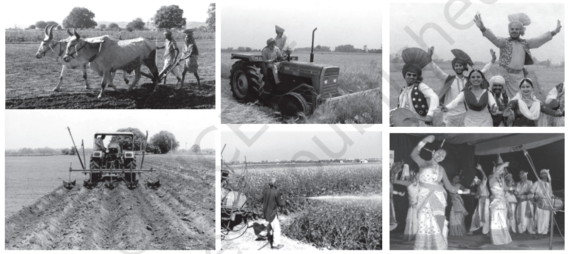
Different means of agriculture and related festivals.

Indian society is primarily a rural society though urbanisation is growing. The majority of India's people live in rural areas (67 per cent, according to the 2001 Census). They make their living from agriculture or related occupations. This means that agricultural land is the most important productive resource for a great many Indians. Land is also the most important form of property. But land is not just a 'means of production' nor just a 'form of property'. Nor is agriculture just a form of livelihood. It is also a way of life. Many of our cultural practices and patterns can be traced to our agrarian backgrounds. You will recall from the earlier chapters how closely interrelated structural and cultural changes are. For example, most of the New Year festivals in different regions of India – such as Pongal in Tamil Nadu, Bihu in Assam, Baisakhi in Punjab and Ugadi in Karnataka to name just a few – actually celebrate the main harvest season and herald the beginning of a new agricultural season. Find out about other harvest festivals.